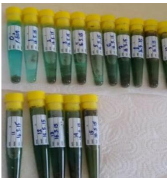
Figure 1. Color changing of 15 pH samples from footbath.

The color of initial sample was light blue, 2 nd sample to 13 rd sample were changed from light became dark green (Figure 1). Then, color changed up to dark brown until 15 th group's sample. Color changed caused by exposure of manure, slurry, and urine in the footbath. Color changed had correlation in increasing pH and decrease the effectiveness of the \text{CuSO}_4 solutions. Color change as well as increased pH range indicated footbath solution needs to be recharged.