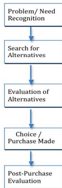
Figure 2.1 The Decision Process Stages of the Engel, Kollat and Blackwell Model. (Source: Engel, Kollat and Blackwell, 1978)

dissatisfaction arising from the discrepancy between the perceived current state and the desired state triggers the need or problem recognition. The internal motives, culture and values which are reflected in the lifestyle drive the needs, decisions and choices as lifestyle reflects the highest level of choice in a hierarchy of decisions (Saloman & Ben-Akiva, 1983). Lifestyle is described as the result of personality differences in the way individuals internalize environmental influences such as economic and demographics effects, cultural norms and values as well as social class and family influences over time (Engel, Kollat & Blackwell, 1978). Engel, et.al (1978) also goes on to extend the scope of lifestyle as a pattern of enduring traits, activities, interests and opinions that determine general behavior and thereby making each individual distinctive.