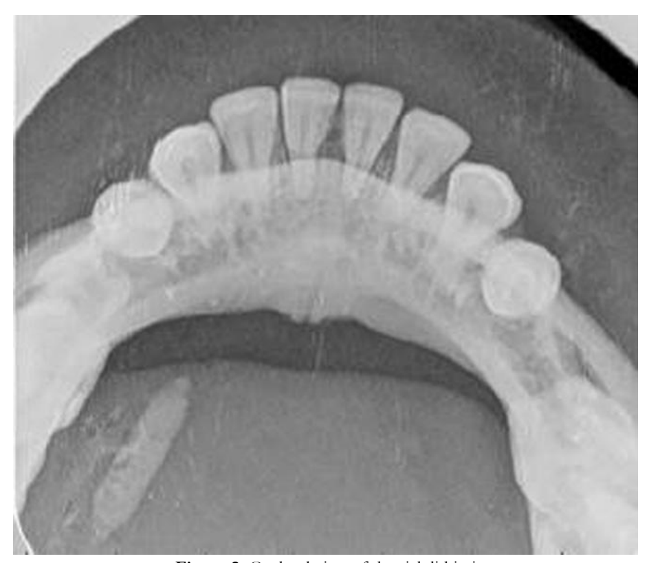
Figure 2. Occlusal view of the sialolithiasis