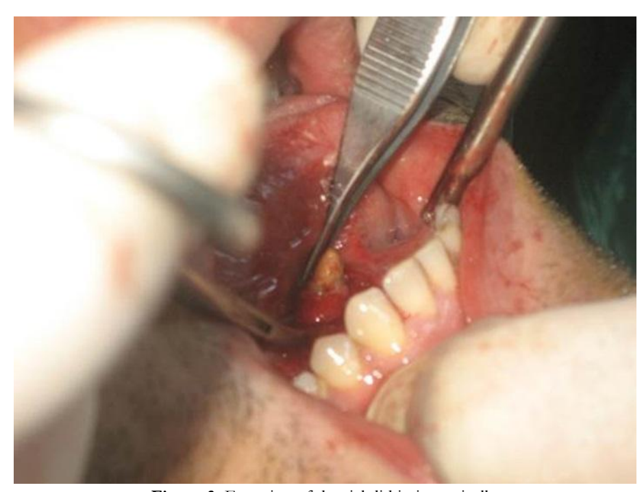
Figure 3. Exposing of the sialolithiasis surgically