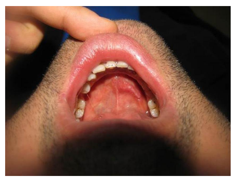
Figure 6. Healing, 7 days after surgery