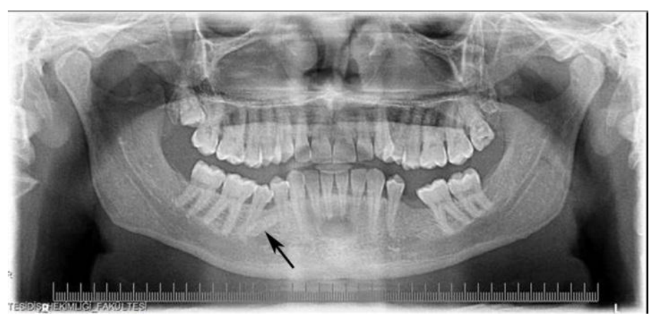
Figure 1. Panoramic view of the sialolithiasis