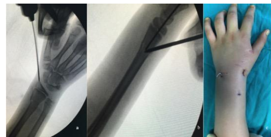
Figure 3. Patient 2, a) Intraoperative picture of the transphyseal entry point of the wire. b) Reduction was achieved by leveraging the proximal part with Schanz applied dorsally where the reduction of the proximal part can not be obtained. c) The distal ends of the wires were bent outside the skin.