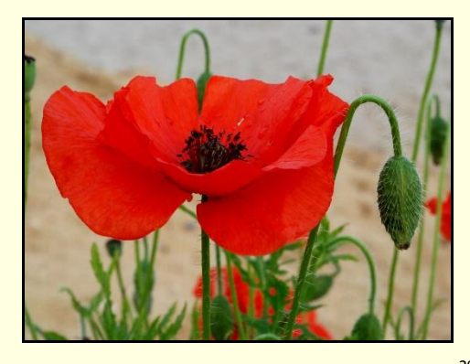
Figure 10. The flower of Papaver rhoeas L.<sup>29</sup>

Corn poppy is herbaceous and it grows 50-60 cm. This plant spreads in Marmara, Black Sea, Mediterranean and Eastern Anatolia regions.<sup>8</sup> The young fruits of Papaver rhoeas L. are decoction and it is used for cough.<sup>16</sup> This plant species can be used in parterres, plant boxes and rock gardens in landscape architecture works (Figure 10).