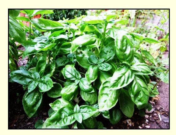
Figure 9. The general appearance of Ocimum basilicum L.<sup>27</sup>

Basil leaves, which are also used to flavor foods, are infused and it is used for stomachache.<sup>26</sup> Basil, which grows up to 50 cm. (Figure 9), is a fragrant plant species besides these medicinal features. It spreads in Marmara, Aegean and Mediterranean regions in our country.<sup>8</sup> This plant species can be used in flowerpots and plant boxes at indoor planting design works. And also it can be used in outdoor plating design works which will be done at courtyard gardens, windows and balconies.<sup>4</sup>