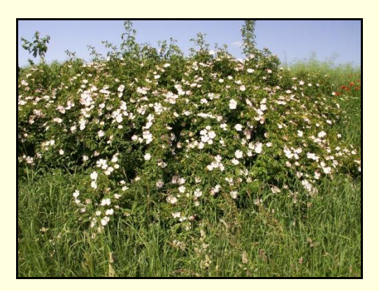
Figure 11. The general appearance of Rosa canina L.<sup>30</sup>

It is suitable for use especially in rural landscape, road slopes and refuges. In this direction, it can be used as an erosion preventive plant in areas where erosion is dangerous in our country.<sup>3</sup>