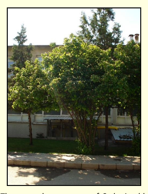
Figure 3. The general appearance of Cydonia oblonga Mill.

Cydonia oblonga Mill., which can be grown up to 4-6 meters, is a decorative species with flashy flowers and fruits as well as leaves changing color in autumn and it is very suitable for small places (Figure 3).<sup>10</sup> It spreads in the South of Marmara, Western and Central Black Sea and Mediterranean regions in our country.<sup>8</sup>