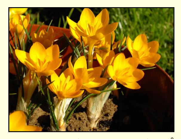
Figure 1. Flowers of Crocus ancyrensis (Herb.)<sup>9</sup>

Crocus ancyrensis (Herb.) Maw, used in "crocus rice", is used as an ornamental plant in parks and gardens with flashy yellow flowers opening between February-March (Figure 1).<sup>1</sup> It is an endemic species and it spreads in Western and Central Black Sea, Mediterranean and Central Anatolia regions.<sup>8</sup>