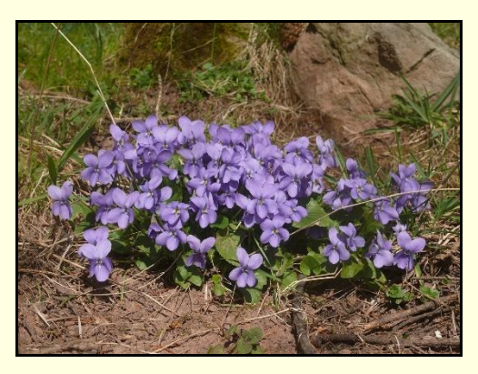
Figure 14. The flowering period of Viola odorata L.<sup>37</sup>

Viola odorata L. is grown almost in all regions.<sup>8</sup> Violet grows 10-15 cm. and it can be used in groups in seasonal flower parterres with fragrant and aesthetically effective flowers (Figure 14).