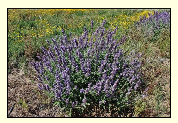
Figure 13. The flowering period of Salvia fruticosa Mill.<sup>32</sup>

Besides its medicinal properties, it also has aromatic properties with bluish-purple flowers. The fragrant flowers that bloom in June - July stimulate the smell and sight senses. Also it can be used solitary or in groups in roof and terrace gardens as well as in flower beds and plant boxes for functional and aesthetic purposes in planting design works (Figure 13).<sup>4</sup>