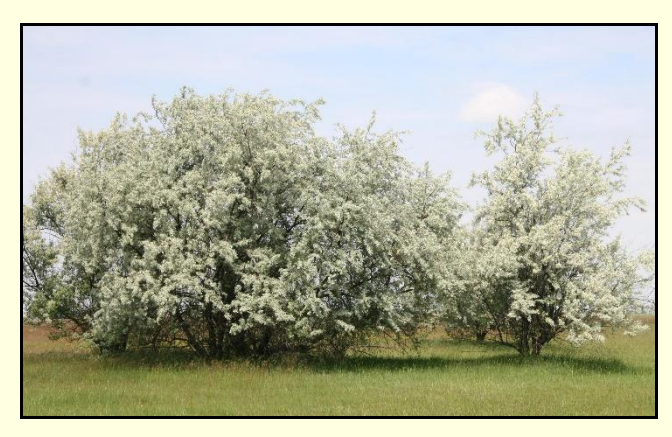
Figure 4. The general appearance of Elaeagnus angustifolia L.18

Elaeagnus angustifolia L. grows in all regions except Southeast Anatolia in Turkey.<sup>8</sup> Russian olive can be used for planting dunes and forming fence texture in landscape architecture works (Figure 4).<sup>17</sup>