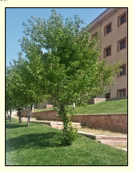
Figure 6. The general appearance of Liquidambar orientalis Mill.

Liquidambar orientalis Mill. spreads in Aegean and Mediterranean regions in our country and it grows 20-25 m (Figure 6). Sweetgum is a deciduous tree and it is used to create shadow areas in parks and gardens and also it can be used on road sides.<sup>17</sup>