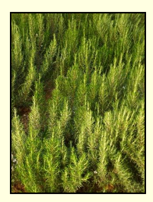
Figure 12. The general appearance of Rosmarinus officinalis L.

Salvia fruticosa Mill. (Sage/Adaçayı): The word "sage" comes from the word "salvare" which means "to save" in Latin. This plant, which represents immortality, wisdom and protection, has influenced many cultures. In the Arab world, while the sage growers are not believed to die, in Christianity the sage is one of the symbols of the Virgin Mary. It is also known that the Romans regarded the sage as sacred and that the sage collection was performed in a special ceremony, while in the middle ages the sage was a drug used against febrile illnesses. <sup>6,7,11</sup>