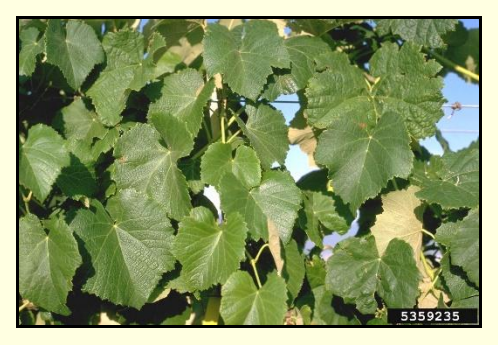
Figure 15. The leaves of Vitis vinifera L. 41

Vine covers wooden, plastic and steel constructions and it take on a task of shading, bordering and screening in landscape architecture works (Figure 15).<sup>40</sup>