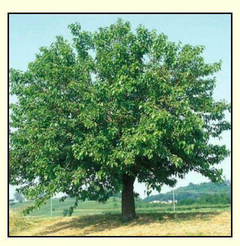
Figure 7. The general appearance of Morus alba L.<sup>22</sup>

Morus alba L., a tree that can be grown up to 10-15 meters, is suitable to be used as a shadow tree in the sitting areas and pedestrian paths (Figure 7). 10 It spreads in all over Turkey. 8