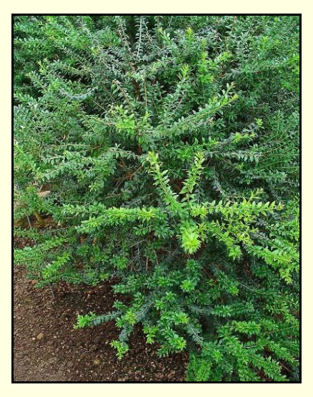
Figure 8. The general appearance of Myrtus communis L.<sup>24</sup>

Myrtus communis L., a shrub that can be grown up to 2-3 meters, can be used as a fence plant in landscape architecture works (Figure 8). It spreads in the South of Marmara, Black Sea, Aegean and Mediterranean regions.<sup>8</sup>