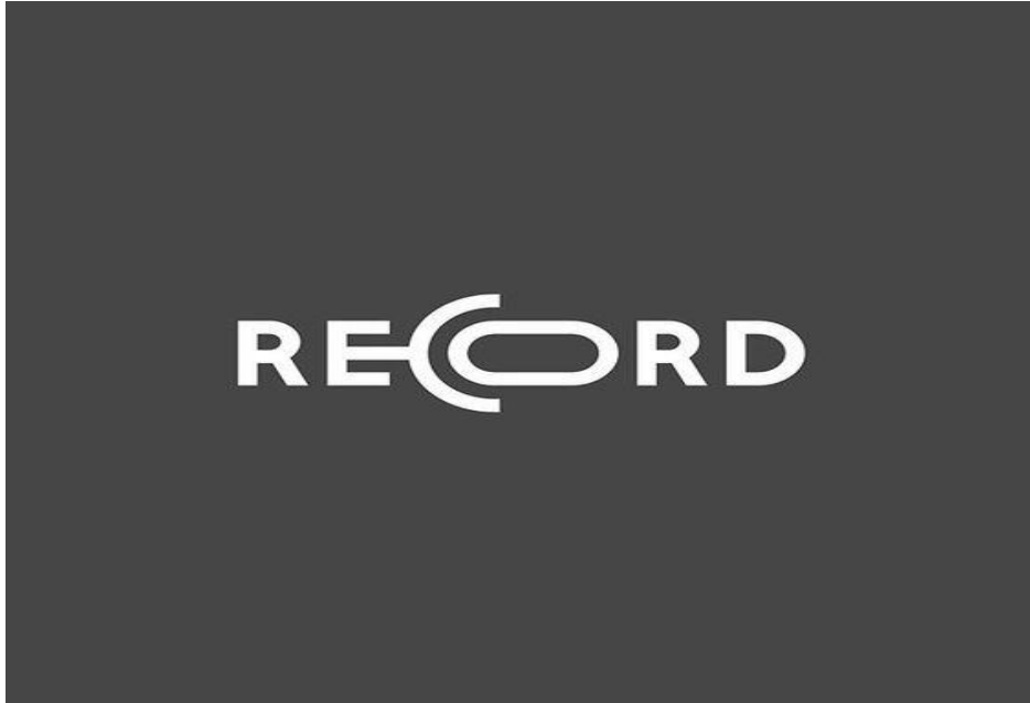
Picture 1: Minimal Logo Designs collection of Steven Crosby ( https://www.downgraf.com/inspiration/logo-design-inspiration/minimallogo-designs-collection/ )

Steven Crosby designed 'Record' word with design principles. He gives functional dimension to his work. And It has also gained an aesthetic value.