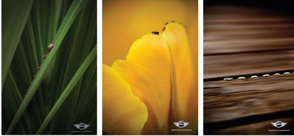
Picture 4: Mini Cooper's Advertisement Poster ( http://www.dijitalajanslar.com/yaratici-reklam-afisleri/ )

Design and creativity are connected by such a fine line, and there is no mention of a style that exists in self-replicating design products that cannot use creativity. The designer must follow a path that renews its own design products in every work but preserves its originality and personal characteristics.