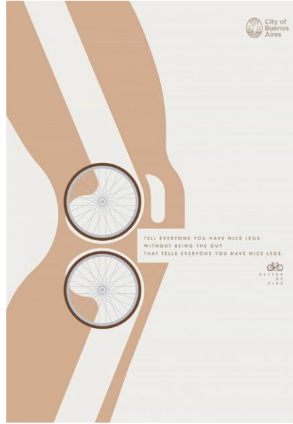
Picture 3: Studio La Comunidad Argentina's poster of cycling campaign ( http://www.dijitalajanslar.com/yaratıcı-reklam-afisleri/ )

People can reorganize their lives by understanding and practising the creative imagery. Thanks to the creative imagery, it is possible that a person amends his belief about himself and the world and the results of this belief. All advances of our civilization are consequence of creative imagination. Science fiction books and magazines which were labelled as figment but were actually products of inhibited imagination in the past are accepted as realistic today (Addington,1999:25).