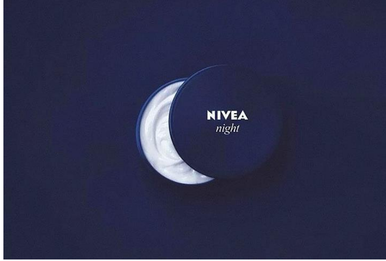
Picture 2: Advertising Banner of Nivea cream ( http://www.dijitalajanslar.com/yaratıcı-reklam-afisleri/ )