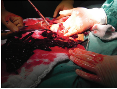
Figure 1: Ruptured cornual pregnancy with 11 weeks of gestation.

Intraoperative hemoglobin was 5mg/dl and hematocrit value was 14% 4 units red blood cells were transfused. Admission serum beta-human chorionic gonadotropin (beta-hCG) was 13496 IU/ml and serum beta-hCG levels progressively decreased after the operation.