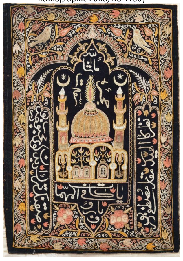
Picture 5. Prayer rug, 19th century (National Museum of Azerbaijan History, Ethnographic Fund, No 4150)