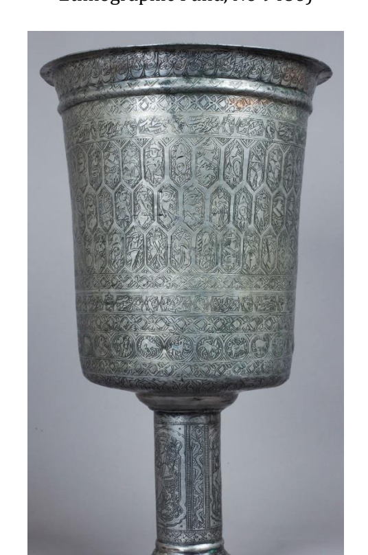
Picture 4: Sharbatkhor, 19th century (National Museum of Azerbaijan History, Ethnographic Fund, No 9486)

The blessings of Allah to the Prophet Muhammad, his daughter Fatmayi-Zahra and the twelve Shiite imams are engraved in a large, beautiful line on the belt-shaped border of the mouth of the syrup No. 9486 which belongs to the Ethnographic Fund of National Museum of History of Azerbaijan: