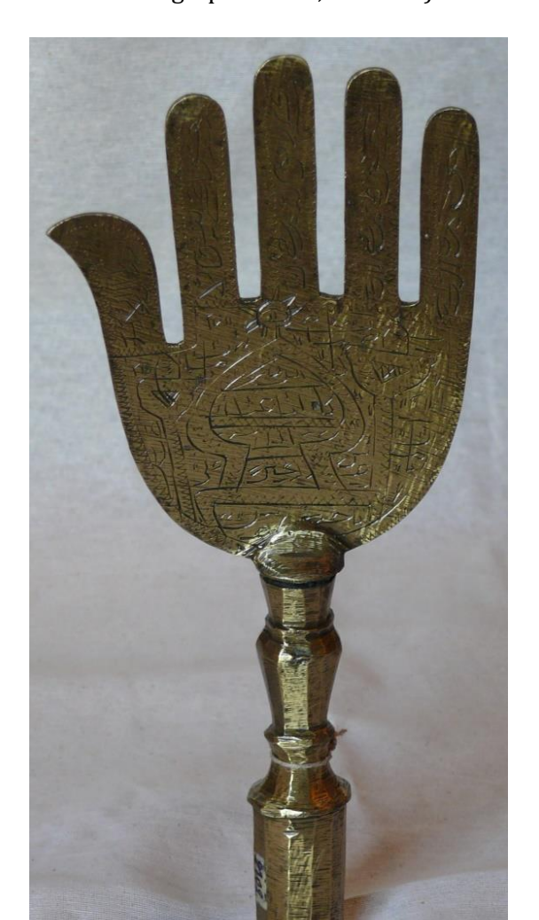
Picture 2: Alam, 19th century (National Museum of Azerbaijan History, Ethnographic Fund, No 3284)

We have to point that in different regions of Azerbaijan in the past on "alam carrying" ceremonies not everybody could hold "alam" as it was considered holy one. The men called "Dastabashi" (Group leader) "Alamdar" were chosen for it who passed youth and had prestige among people. Besides, istorical literature and ethnographic materials show that this ceremony was held under the name of "Shakhsey Vakhsey" (it means Shah-Husayn, vakh-Husayn) in some regions of Azerbaijan and country sides of Baku (Musayev, 2006, 252, NMHA EF No, 1331, 1339). Both on "alam carrying" and "on Shakhsey Vakhsey" ceremonies rhubarb and elegies were told which were described the Battle of Karbala. Historical literature informs that such ceremonies, which were register officially during the Safavids reign, were also held in earlier times too. According to this historical information, rituals, ceremonies and condolences describing Karbala event were held everywhere in Azerbaijan before Safavids period (Bünyadov - Əliyev, 1994, 153). In modern time, this ceremony is more characterized for Lankaran-Astara regions where religious traditions are stronger.