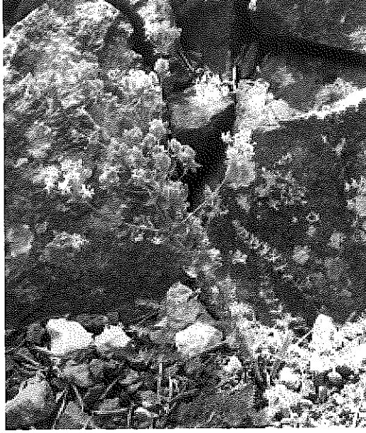
Figure 1: Ferulago trojana

species, 26 of which were from Turkey (7). Since the time of the account of first Flora of Turkey, several new taxa have been added such as F. idaea , F. trojana and F. glareosa .