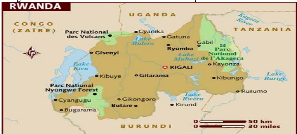
Figure 2: shows the map of Rwanda

Rwanda is located in the Central-East Africa and by area it covers 26,338sq km (10,169 sq. miles), its population is estimated to be 11.2 million people. Rwanda's immediate neighbors are Uganda, Congo. Tanzania and Burundi as indicated on the map below.