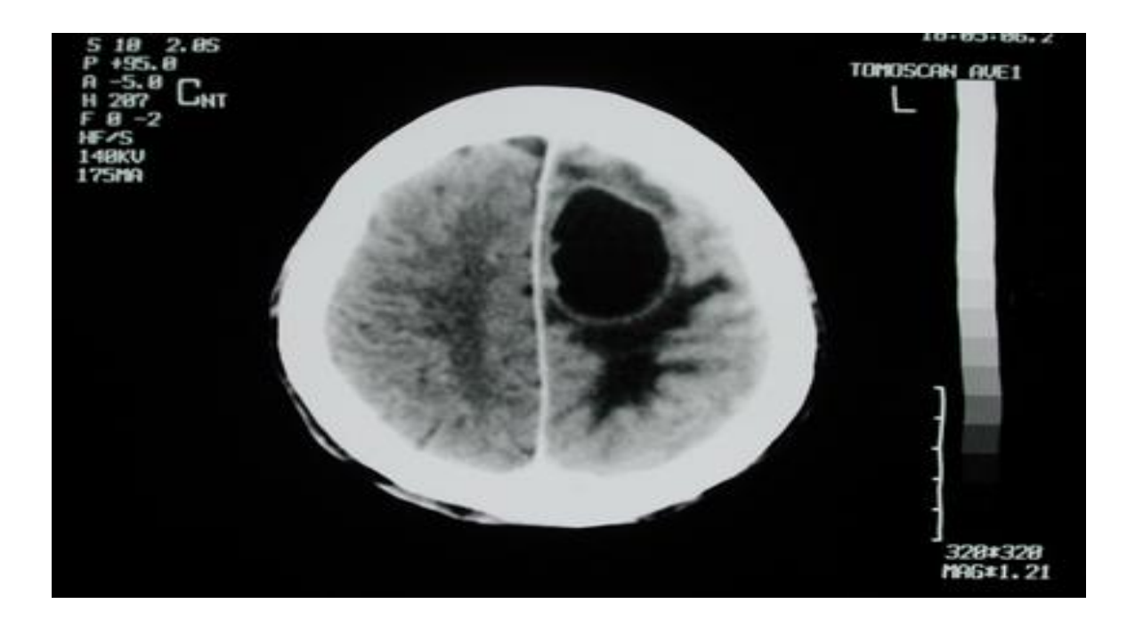
Figure 3. CT scan of head before second operation. Contrast enhanced CT image showed intraparenchymal rim like e