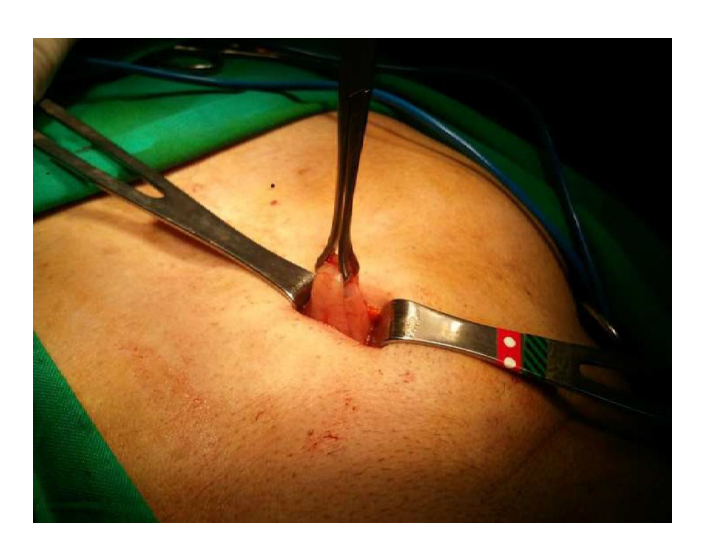
Figure 1. Gastric wall was pull out via a Babcock.

due to obstruction or sedoanalgesia rejection of endoscopy. The same operative technique was used in all patients and Cefazolin sodium (1000 mg) was used for antibiotic prophylaxis.