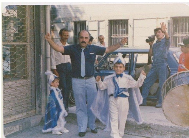
Figure 5: “The Dance of the Father and Son”, (Taşıtman’s Family Album, 1988 used with permission)