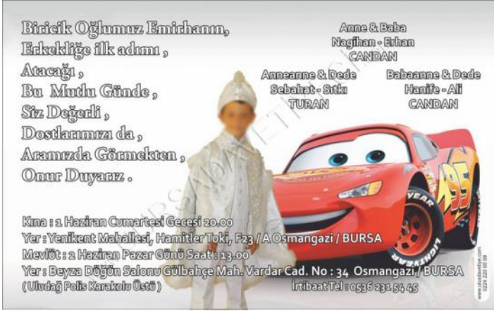
Figure 9: Invitation Card

“On this blissful day our one and only son will take his first step to manhood, we will be honoured to see you, our friends beside us” (see www.bursadavetiyeci.com )