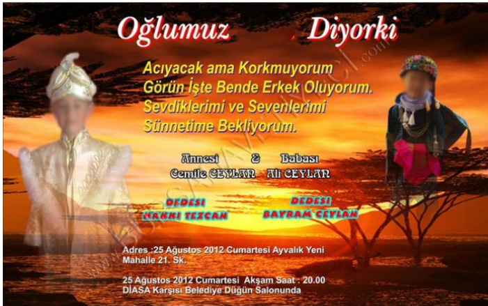
Figure 10: Invitation Card

“On this blissful day our one and only son will take his first step to manhood, we will be honoured to see you, our friends beside us” (see www.bursadavetiyeci.com )