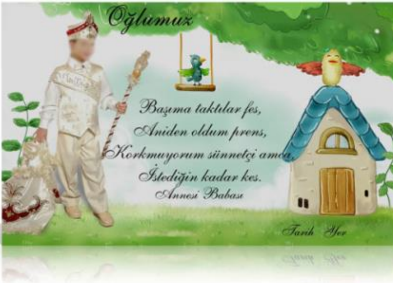
Figure 8: Invitation Card

The idea emphasized in most of the invitation cards is that the boy will become a man from then on. In the majority of the samples there are expressions referring to the necessity of ceremonial circumcision to grow into adolescence, the continuity of the father's lineage, courage and fearlessness. Mostly, a picture of the child in his circumcision costume, holding a scepter in his hand on horseback (like a prince) accompany these expressions.