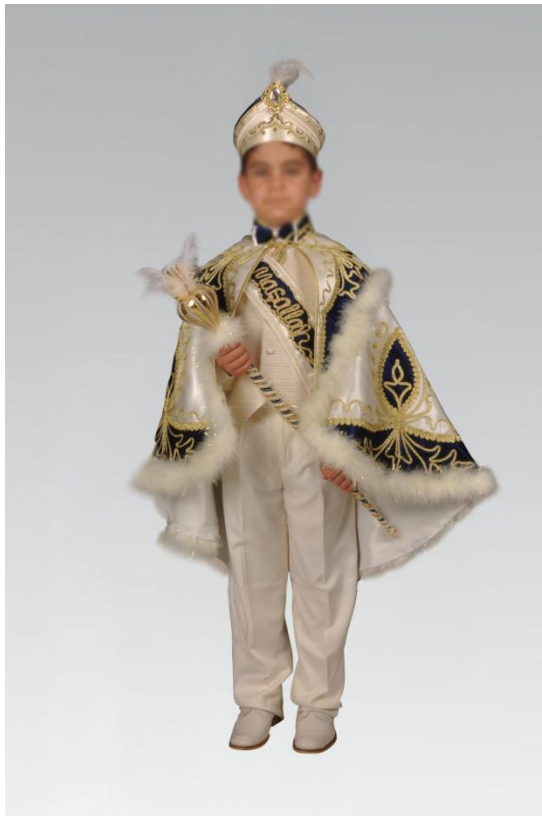
Figure 1: Circumcision dress (see www.sunnatelbisesi.com )

for the bed lining and decorations. The house is prepared so that it can host the guests during the circumcision ceremony and the following few days and treats like snacks and beverages are kept available. Among the preparations, the costume of the circumcised child is of significant importance because of the symbolic meanings it has. Particular shopping is done for the circumcision costume in advance. As every piece of the costume has a different meaning and function, details are taken into consideration. A comfortable undershirt is bought and appropriate underwear and pajamas to be worn after the circumcision are chosen. The outer pieces of the costume usually consist of circumcision pants, shirt, a cloak worn over the shirt, and most of the time a hat designed like a tarboosh.