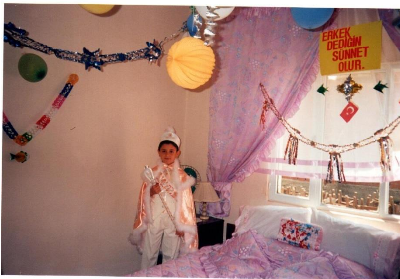
Figure 4: Circumcision bed (Hanged paper means “Real men must be circumcised”) (Interviewees’s Family Album, 1995 used with permission)

After the preparations in the household are completed, the family members and the close relations start organising the circumcison feast. One day before the day of circumcison feast, the child is dressed in the circumcison costume and taken to a Turkish bath with the children of the relatives and other invited men. After the ‘purification’ and ‘cleaning’ ritual, again in the circumcison costume, visits the relatives and kisses the hands of the elderly. If there are any religiously significant places in the city the family inhabits, these places are visited to make wishes and pray for the circumcison to be auspicious. vi