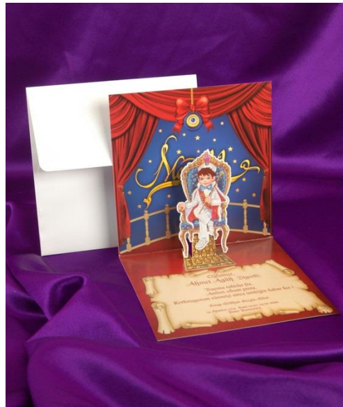
Figure 7: Invitation Card (see www.sedefcards.com )