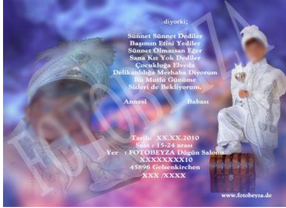
Figure 11: Invitation Card

"They kept saying 'circumcision' and got me fed up. And they said, if no circumcision, no bride, Farewell to childhood, salute to youth, I will be expecting you to my feast" (see www.fotobeyza.de )