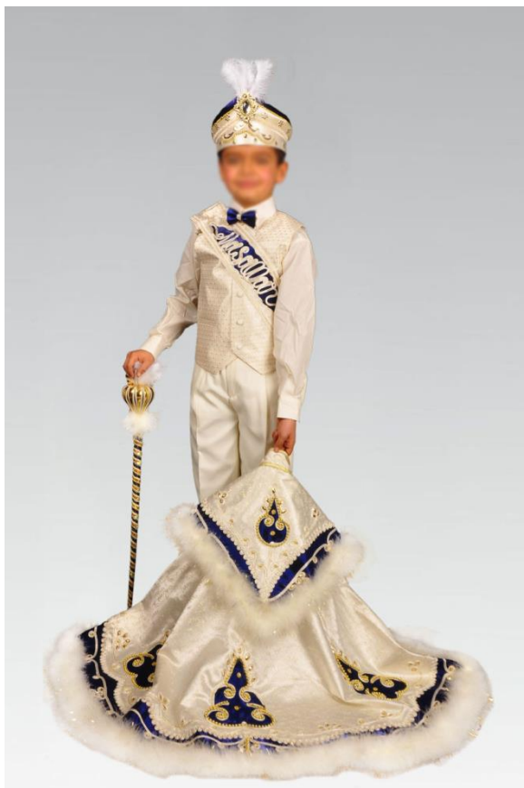
Figure 2: Circumcision dress (see www.sunnetelbisesi.com )

Protection from all evil is wished for the circumcised child with the band saying ‘ maşallah! ’ iv worn over the circumcision costume and blue beads v . The hat, the gilded cloak, the scepter which completes the costume turn the male child almost into a king. One of the interviewees expresses what he remembers about the costumes as follows: