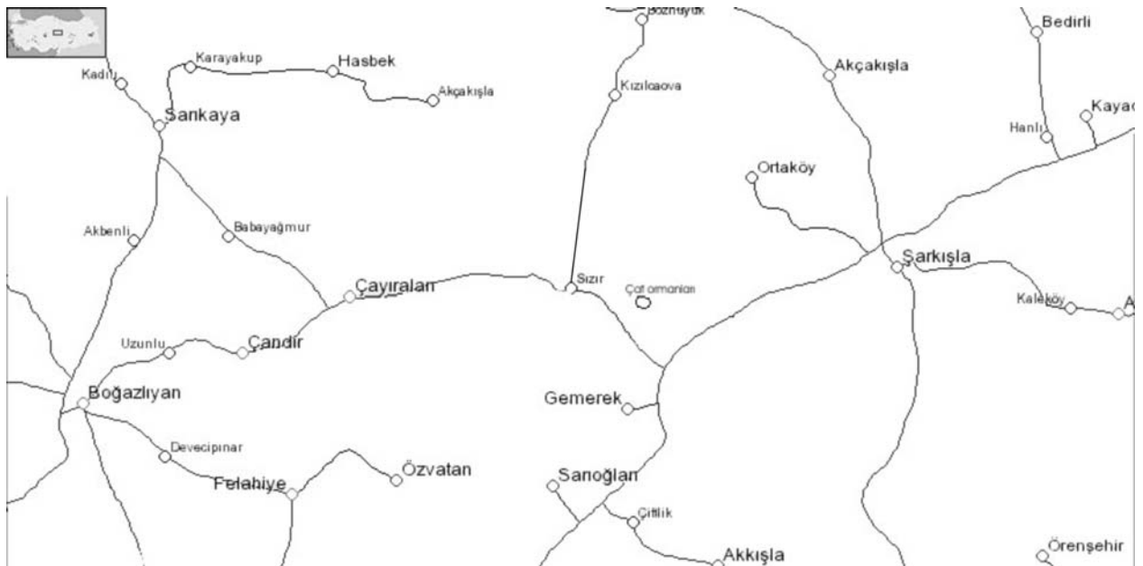
Figure 1. The map of the study area.

The list of lichens is based on original collections of the author in 2005. Specimens collected from the study area are stored in the herbarium of Erciyes Üniversitesi, Fen Edebiyat Fakültesi, Biyoloji Bölümü, Kayseri. The nomenclature follows Hafellner & Türk (2001) [6] and other modern results [7]. Author names are according to Brummitt & Powell (1992) [8].