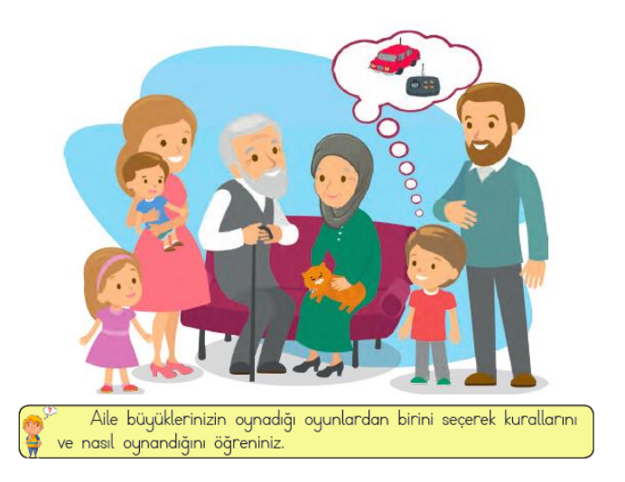
Figure 4. Making research (Çelikbaş, Gürel and Özcan, 2018)

As seen in Figure 4, the students were asked to learn what the toys and games played by their elders in the past were, and how they were played.