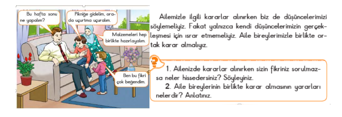
Figure 3. Expressing child's thougts (Kuşkaya, 2018)

According to Table 5, Units 1, 2 and 5 involve subjects about family in the primary school second-grade textbook. Like in the first-grade textbook, those units cover the activity 'Expressing child's thoughts and feelings' in the second-grade textbook. However, there are also other activities such as 'filling in the gaps and puzzles, reading activity'. An example of the activity of 'expressing the child's thoughts' is given in Figure 3.