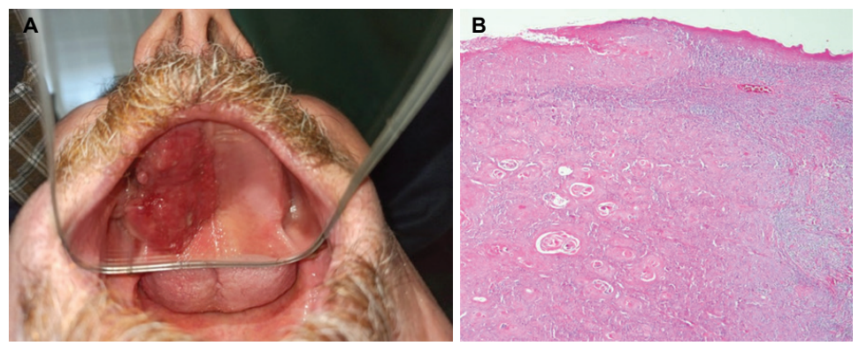
Figure 1. A clinical appearance of OSCC, B histological appearance of OSCC (HEx40).

*Correlation is significant at the 0.05 level (2-tailed).