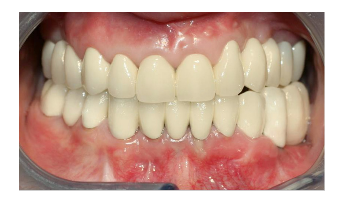
Fig. 5 Final view of the patient with prosthetic restoration.