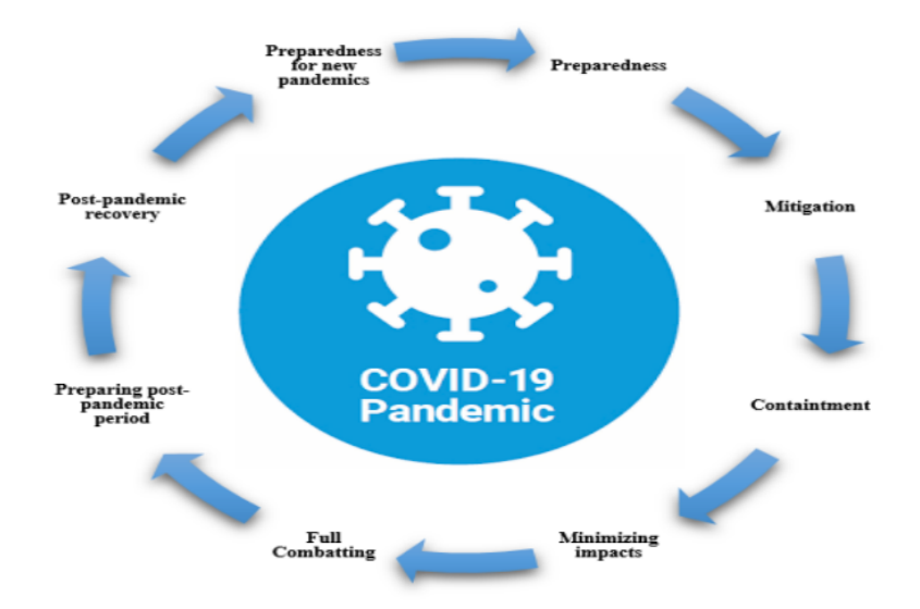
Figure 1: The Covid-19 Combatting Cycle

Source: The figure in the middle has been created by the researcher based on the literature studies. The image in the middle is cited from the United Nations website.