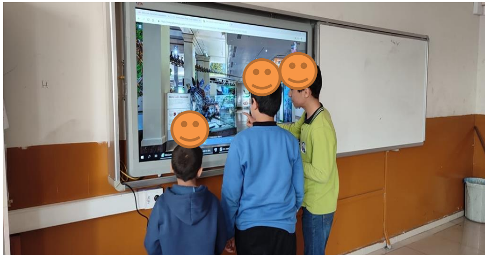
Figure 1. Students Leading The Tour to Find Answers of Their Questions