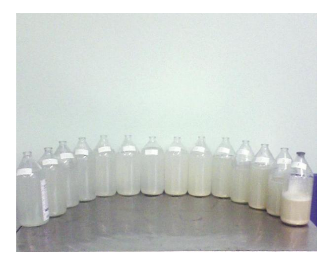
Figure 4. Gradual decrease in density of the BAL fluid and precipitate amount in the same session (right bottle indicates the first lavage fluid and the left bottle indicates the last one).

In all, a total of 14 L of isotonic physiological serum were given and 13.5 L were aspirated. The aspirated fluid was initially milky and the last aspirate was clearer. Decreased precipitates in the bottle were observed as well (Figure 4).