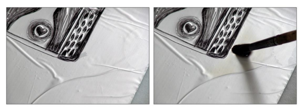
Figure 8. Applying corrosion with brush to the areas that are not corroded.

After Aluminum folio is completely cleared from coke, the press stage starts. The surface of the folio is moistened with natural sponge. The stickiness of the paint that will be used (oil paint, printing ink) is decreased by adding powder. When powder is not added, the paint collects on areas that are not desired on the folio. The paint is given to the moistened folio with a hard rolling pin. The folio must be kept moist continuously when applying this process. Otherwise, the paint stays in areas other than the drawn area. If there is paint in these areas, these areas are wiped with wet wipes to clear the extra paint.