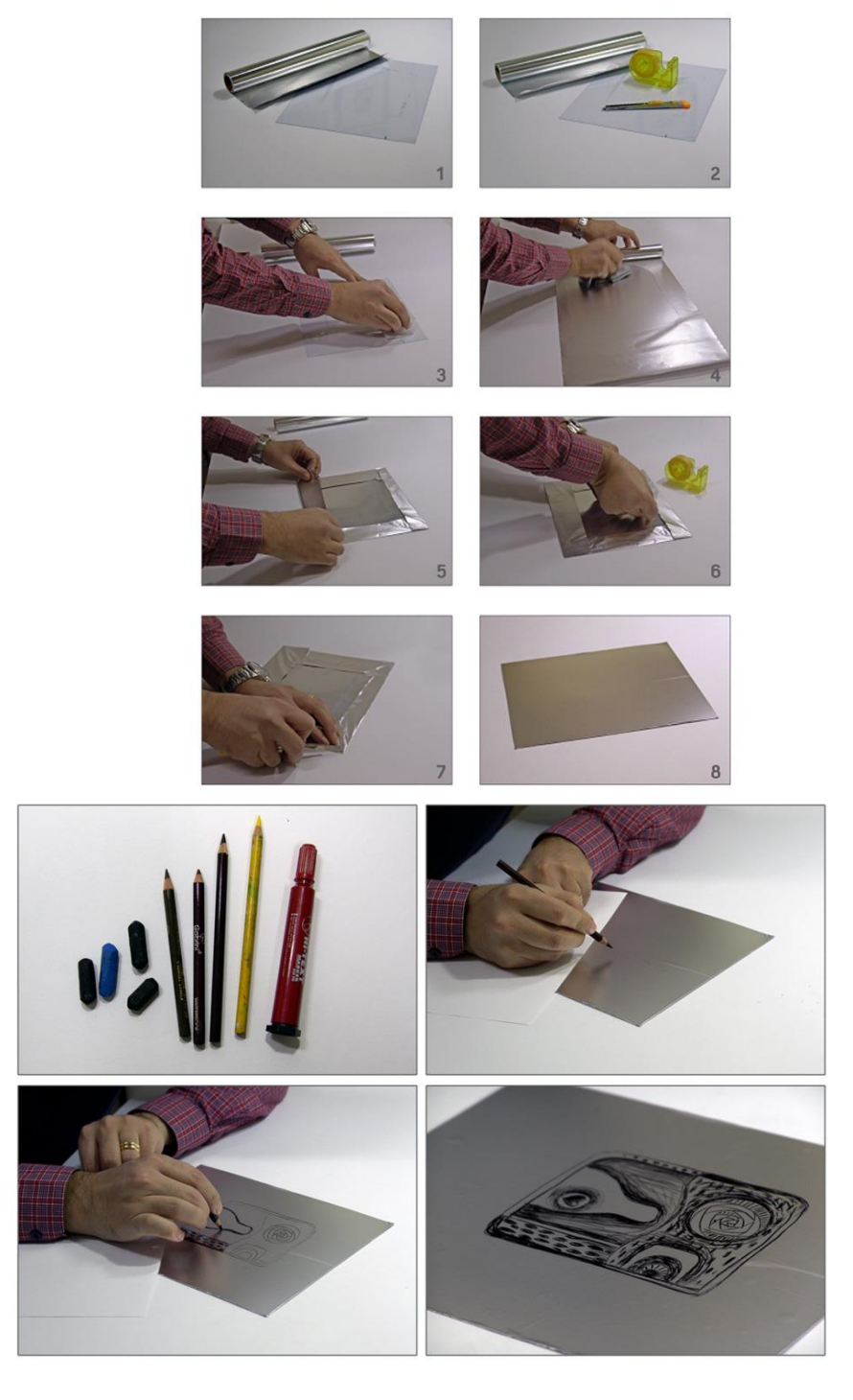
Figure 6. Drawing on foil