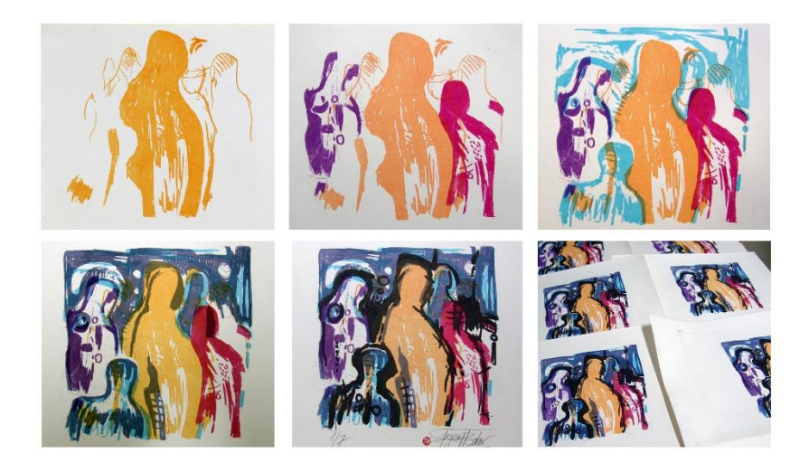
Figure 10. The press stages of colors in kitchen lithography technique

In press trials, 20-30 prints may be obtained without damaging the mould. This number is adequate when the facility of the technique is considered. It is considered that an adequate number is obtained especially for students. It is also possible to work with colors in this technique. In color works, the work is completed by following an order beginning from light color to dark ones, which is the case in relief printing.