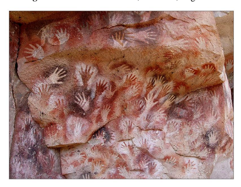
Figure 1. Cueva de las Manos, 7300 BC, Argentina

leave traces behind or for the desire to re-produce existing things. The action of re-producing increased especially with the invention of printing press and had a wide variety from then on. In time, the aim of re-producing evolved as an artistic activity and not for merely re-producing texts, and then the art of "print making" came into being. Print making lies in a line that reaches to human beings easily because of being re-produced easily and because of including all the characteristics of painting pictures and due to its being authentic (Ilbeyli, 1994, p.59). Print making has a different structure not only with its specific contents but also with its technical characteristics, and handles the aesthetical concern in the field of art with its own methodology together with its technique and materials (Ilbeyli, 1994, p.60).