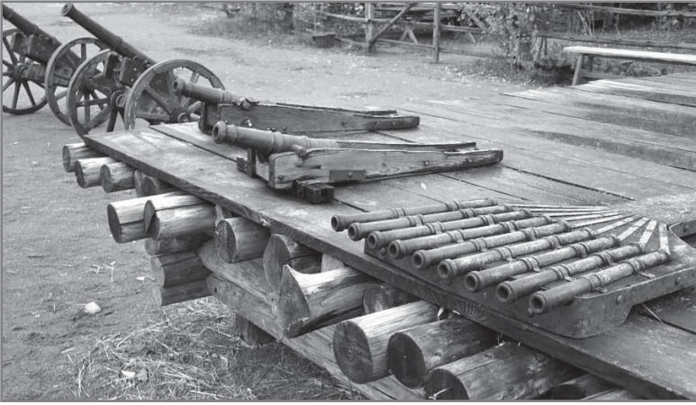
Zaporozhian Cossack multi-barrel gun [courtesy of Victor Ostapchuk]

Ottoman volley gun; early 16<sup>th</sup> century (Musée de l'Armée, Paris) [http:// en.wikipedia.org/wiki/Volley_gun]