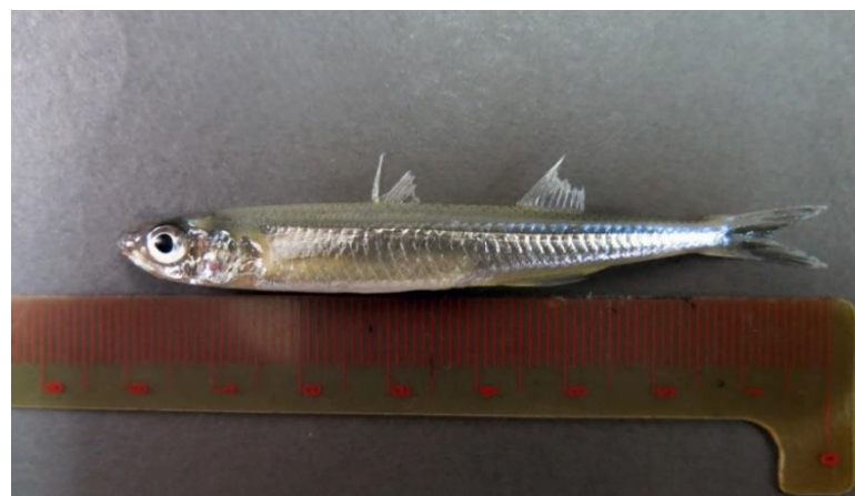
Figure 2. The overall appearance of A. boyeri caught in Seyhan Dam Reservoir