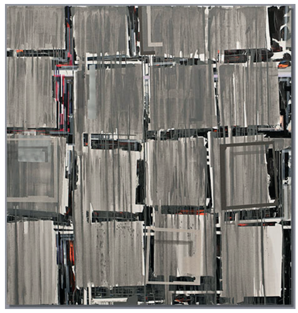
Pic. 14: Nuri Kuzucan "Further 3" (2018)

The artist moves to graphic abstraction and this is accompanied by the expression of the artist's emotional experience, recorded in the work Further-3 (Pic. 14). The repetitive plot of the quarter lattice is rather rough and temperamentally shaded. Thematically related works of past years are repeated in the form of pure graphic compositions. The New Residential Area (Pic. 15) and Flaneur (Pic. 16) will transform into Black And White Shapes (Pic. 17) and 124 Square (Pic. 18) in 2018. More and more often the author resorts to monochrome images, repeating the path of cardinal changes repeatedly demonstrated by the artists of the twentieth century. But working in the paradigm of the culture of the new century, Nuri Kuzucan achieves an amazing result. In fact, the didactic scheme of the New Aesthetics proposed by Gernot Bohme is triggered when the artist receives a trained viewer who perceives his work as the development of an urban landscape transforming into an abstract graphic drawing. The image of the city is guessed exactly the same as New York in the grids of Piet Mondrian. In this clarification of the relationship of reality to fantasy inherent in post-metaphysical thinking, universal structures of speaking about the city as an anthropogenic space are revealed.