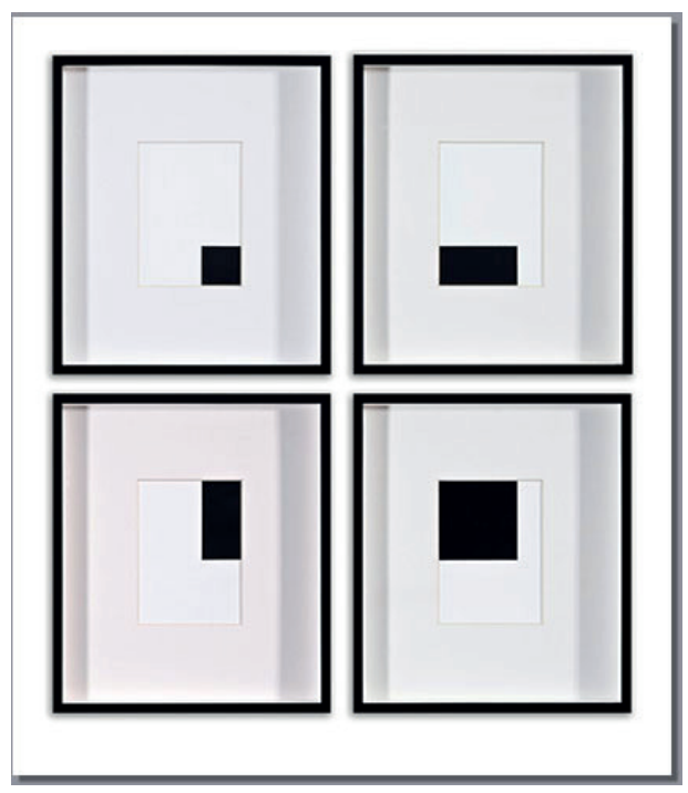
Pic. 17: Nuri Kuzucan Black And White Shapes (2018)