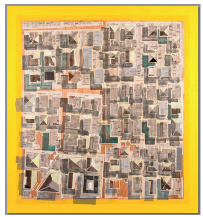
Pic. 13: Nuri Kuzucan "Exotic East" (2011)