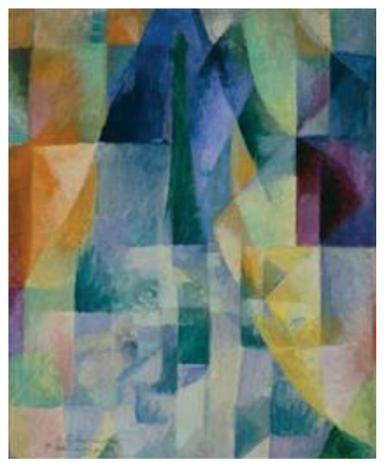
Pic. 3: Robert Delaunay Windows (2nd Simultaneous Motif, 1st Part) (1912) oil on canvas 55×46. Solomon Guggenheim Museum