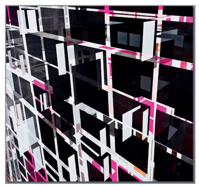
Pic. 19: Nuri Kuzucan "Open Perspective" (2018)