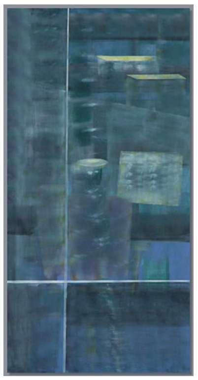
Pic. 6: Nuri Kuzucan "Office" (2008)