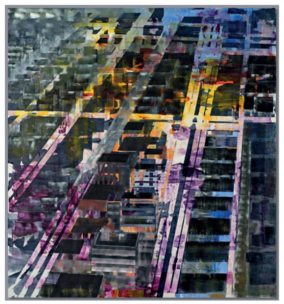
Pic. 12: Nuri Kuzucan "West" (2008)