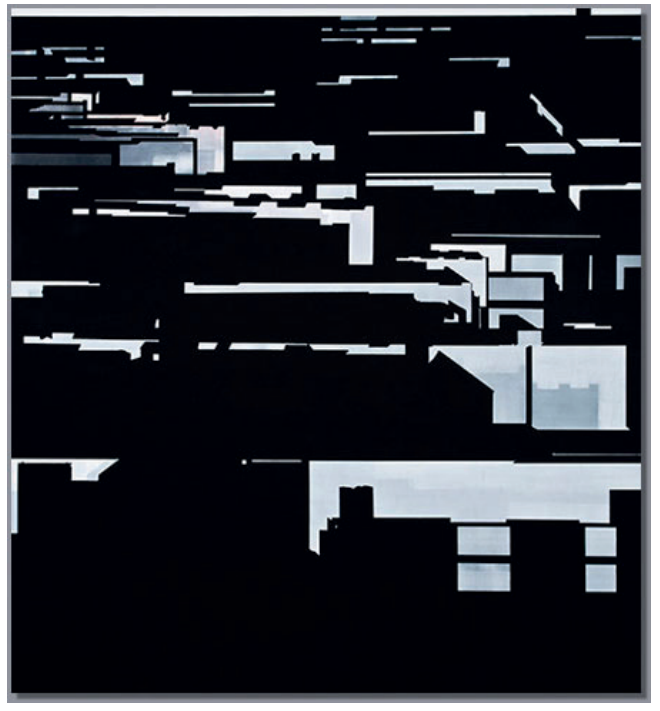
Pic. 21: Nuri Kuzucan "Graphic Memory" (2018)