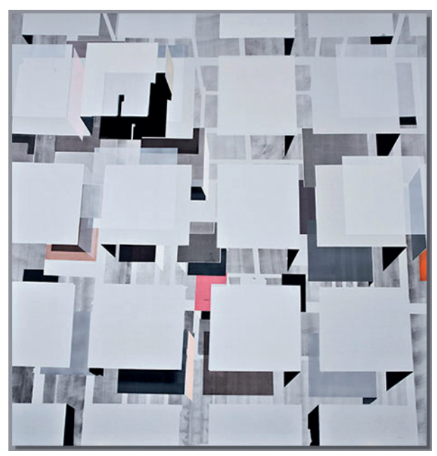
Pic. 18: Nuri Kuzucan "124 Square" (2018)