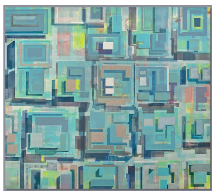
Pic. 16: Nuri Kuzucan "Flaneur" (2011)