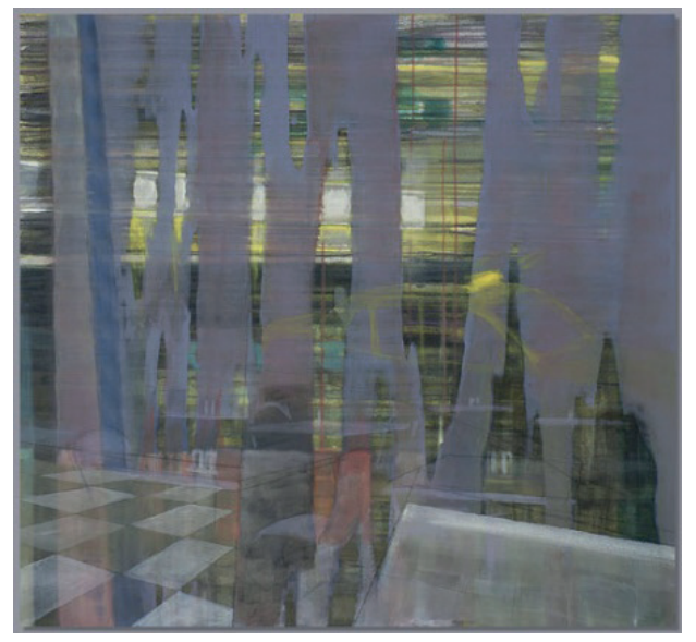
Pic. 7: Nuri Kuzucan "Fastfood-2" (2008)