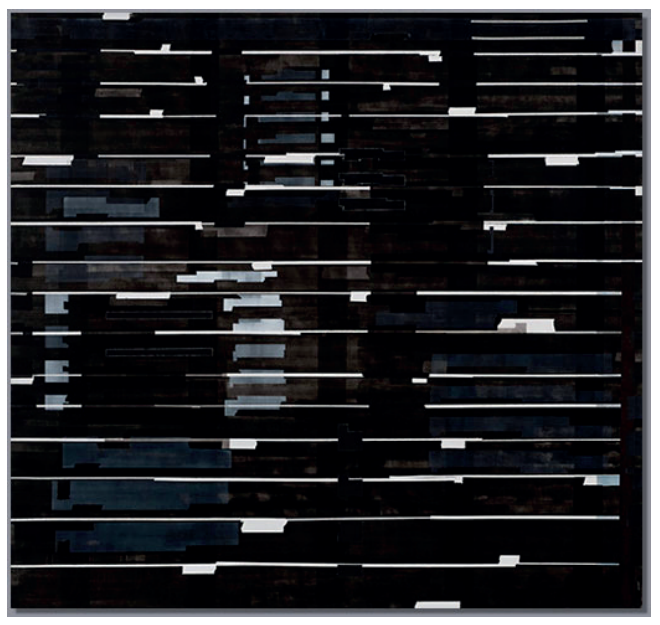
Pic. 22: Nuri Kuzucan "Monochrome City" (2018)