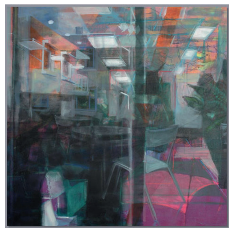
Pic. 1: Nuri Kuzucan. "Purple Window" (2004)

The modern city became the main "character" of all Nuri Kuzucan's works. Moreover, each of the three stages quite clearly conveys the special atmosphere of the urban space. The form of depicting the city reveals those structures of perception on which the mental image of a modern city is based. Step by step, Nuri Kuzucan's works not only create the atmosphere of the city, but also demonstrate changes in the techniques and methods of creating it.