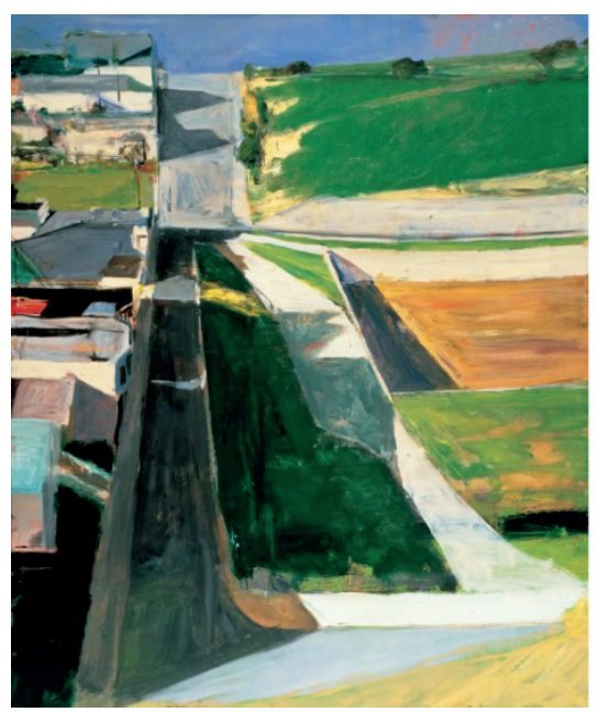
Pic. 11: Richard Diebenkorn "City Landscape No. 1" (1967)

the fragments of a Google map. Thus, the author makes his attitude to this technical innovation clear, just as a new perspective of the city's appearance.