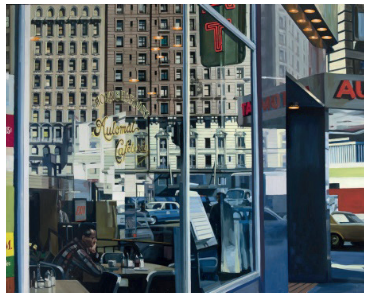
Pic. 4: Richard Estes, Horn and Hardart Automat, 1967. Oil on Masonite, 48 x 60 in. Private collection.