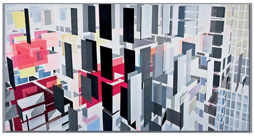
Pic. 20: Nuri Kuzucan "Geomatic City" (2018)

The attitude to the constructed reality is expressed in the work "Geomatic City" (Pic. 20) a mesmerizing density of urban spatial structures, evoking, on the one hand, a feeling of compressed space, since the viewer's gaze rests against the corner formed by rectangles in the center of the picture. On the other hand, lines diverging from the center create a feeling of expanding space. The city occupies the entire space. The world has been transformed into an anthropogenic space.