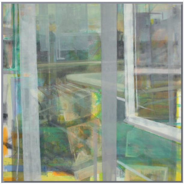
Pic. 2: Nuri Kuzucan "Gray Window" (2004)