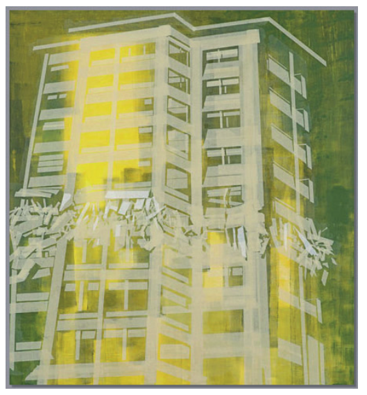
Pic. 9: Nuri Kuzucan "Neighbor" (2008)