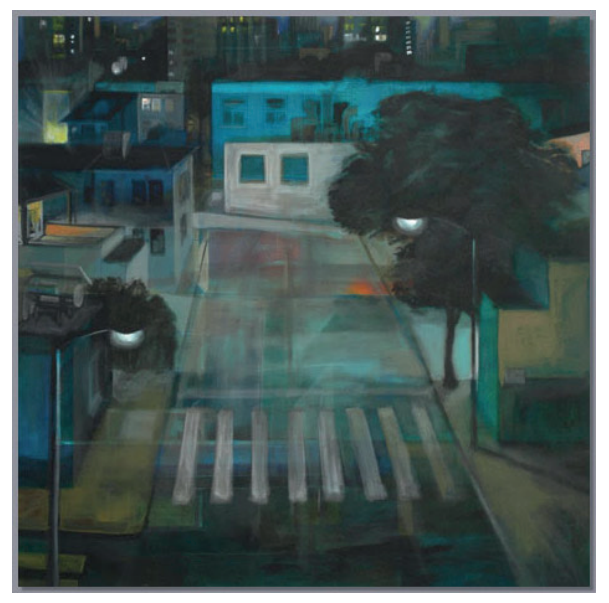
Pic. 8: Nuri Kuzucan "Across" (2004)

From the usual street landscape "Across" (Pic. 8) with a deserted night street to the emotionally tense "Neighbor" (Pic. 9) with a torn floor of a high-rise building - there is no person here, but there is a human space with sadness and fatigue, openness and constraint. The work of Nuri Kuzucan "The Corner" (Pic. 10) is an embodied experience of the compressed space of the city. Everything here is made out of fragments that do not require clarification. The viewer literally squeezes into the space of the city. A desire to move further in order to change the angle appears, but this cannot be done. It's like you're hitting the wall of the house. The narrow strip of the picture literally physically makes you experience the closedness of the city space, where the light panel of the car burns like a bright spot against the background of a blurred urban landscape. These works make the space of the city live, create an atmosphere of its perception, but at the same time the city has no specific reference. This is a city in general, the same global city that comes along with the new century.