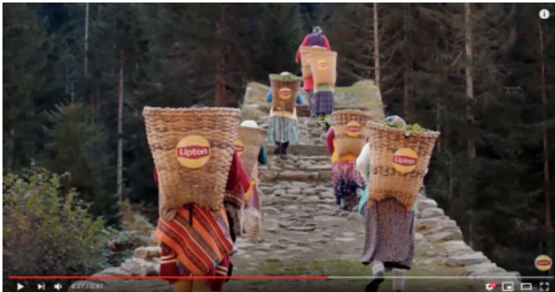
Figure: 3 Lipton ‘Tea Making Easy?’ ad in Turkey – YouTube screenshot ( https://www.youtube.com/watch?v=-fZorydo9S8 ) (Retrieved at 13.04.2019)

Sign: Women climbing up the slope with baskets on their back.