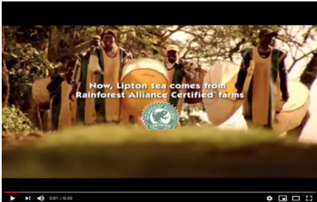
Figure: 4 Lipton ‘Make A Better Choice’ ad in Australia – YouTube screenshot ( https://www.youtube.com/watch?v=ZrjuAiH5AWo ) (Retrieved at 15.04.2019)