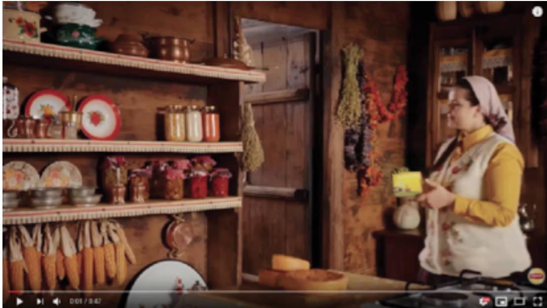
Figure: 1 Lipton ‘Tea Making Easy?’ ad in Turkey – YouTube screenshot ( https://www.youtube.com/watch?v=-fZorydo9S8 ) (Retrieved at 13.04.2019)

discourse on the sincerity and naturalness of the locality. Farmer women teach women from urban areas the particulars of tea-gathering. The advertising film consists of cultural pieces is 48 seconds.