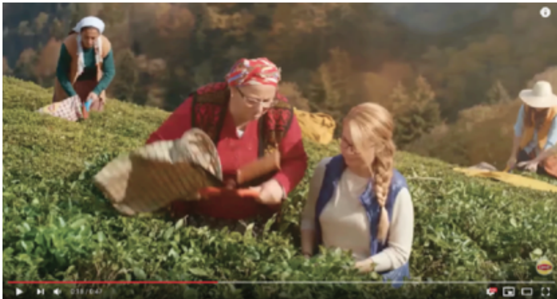
Figure: 2 Lipton ‘Tea Making Easy?’ ad in Turkey – YouTube screenshot ( https://www.youtube.com/watch?v=-fZorydo9S8 ) (Retrieved at 13.04.2019)

Sign: Women working in the field of greenery.