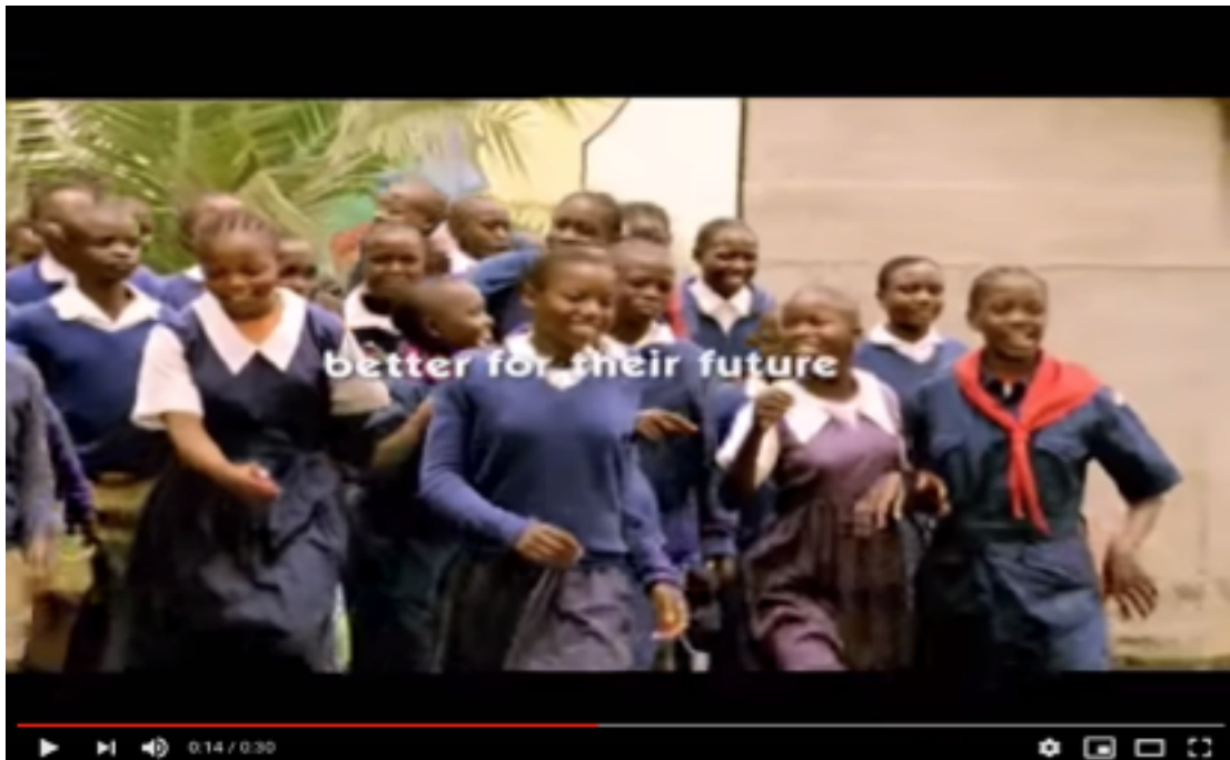
Figure: 5 Lipton ‘Make A Better Choice’ ad in Australia – YouTube screenshot ( https://www.youtube.com/watch?v=ZrjuAiH5AWo ) (Retrieved at 15.04.2019)