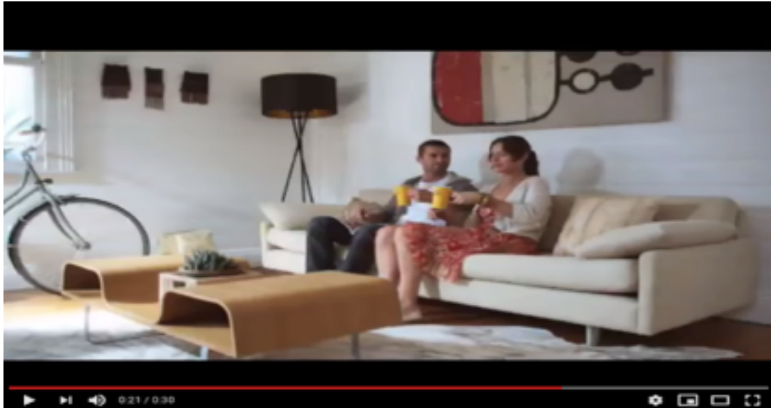
Figure: 6 Lipton ‘Make A Better Choice’ ad in Australia – YouTube screenshot ( https://www.youtube.com/watch?v=ZrjuAiH5AWo ) (Retrieved at 15.04.2019)