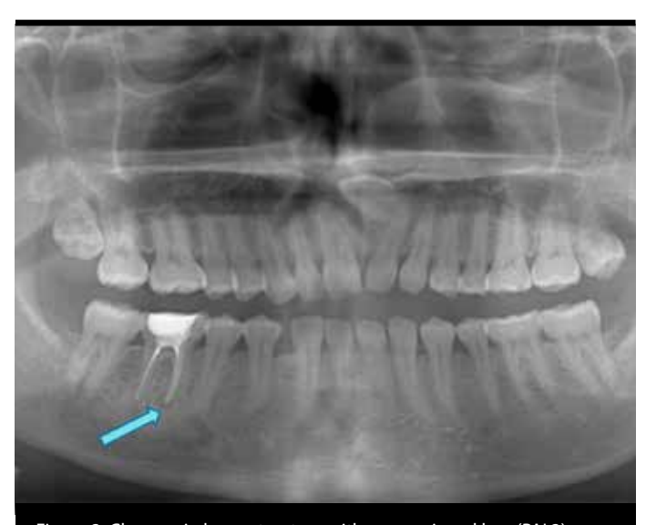
Figure 3. Changes in bone structure with some mineral loss (PAI:3)