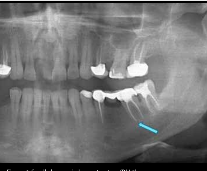
Figure 2. Small changes in bone structure (PAI:2)