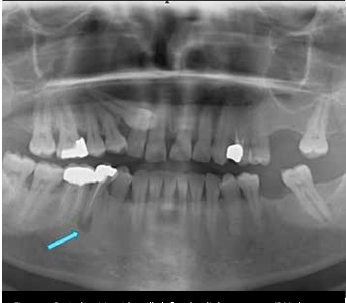
Figure 4. Periodontitis with well-defined radiolucent areas (PAI:4)