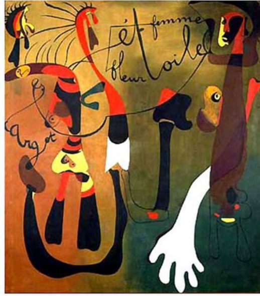
Picture 5. Joan Miro, Peinture (Escargot, Femme, Fleur, Etoile), 1934, Oil painting on Canvas, 195 x 172 cm

In the work that Joan Miro made in 1934, (Picture 5.) it starts with yellow tones and consists of colors that go from brown on the left and go from green to dark blue on the right. The painting features a white hand that hangs in a downward motion, which is the focal point. In the left part of the painting, there is a creature made of organic forms that are not completed in a U shape. The table contains the words he gave to the picture (Peinture, escargot, femme, fleur, etoile). The painting is mostly figure-based and there are creatures that cannot be perceived by the eye. It is a good example of the Surrealism movement, using living organisms and the biomorphic forms in them.