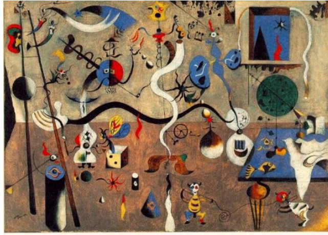
Picture 2. Joan Miro, Harlequin's Carnival, 1925, oil painting on canvas, 66 x 93 cm

Harlequin's Carnival (Picture 2.), made by Miro in 1925, is divided into two parts as ground and background. Imaginary biomorphic forms are used in double plan. In the picture, there is a window in the upper right, perhaps night time. There are fish and different biomorphic forms on a table just below. The cat in front of the table has been hybridized, completely removed from its natural structure. Many surreal forms and living beings are used together. In Miro's work, the images in the artist's subconscious of the images known to everyone are revealed. In the work, organic and inorganic forms are used together. The worm-shaped structure divided the picture into two. It is understood from the sentence "I think this is a lizard, I put a hat on his head" that this structure, which looks like musical notes, starfish, circles of certain sizes, a ladder, a butterfly coming out of the membrane, and a creature, is actually a lizard (Miro, 2016: 53).