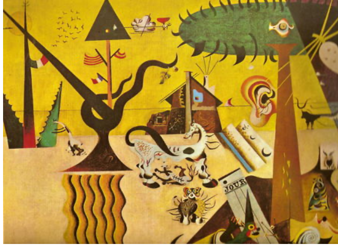
Picture 1. Joan Miro, Plowed Field, 1923-24, oil painting on canvas, 66 x 92.7 cm

used in his works are round and organic shapes. The bright colors he chose in his paintings also added a child-like meaning.