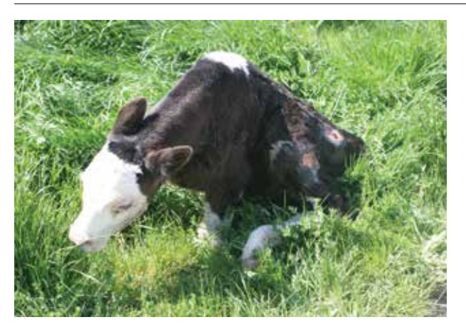
Figure 3. Clinical neosporosis in a Holstein calf exhibiting neurological signs. Notice that decubitis wounds on left hind-limb because of paraplegia.

Şekil 3. Sinirsel klinik belirtiler gösteren bir Holstein buzağıda klinik neosporozis. Parapleji nedeniyle sol arka bacakta dekübit yaraları dikkati çekiyor.