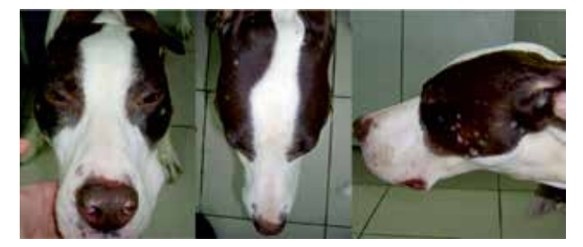
Figure 1. Bilateral severe swelling of the temporal and masseter muscles.

This report describes inflammatory muscle myopathy restricted to the muscles of mastication.