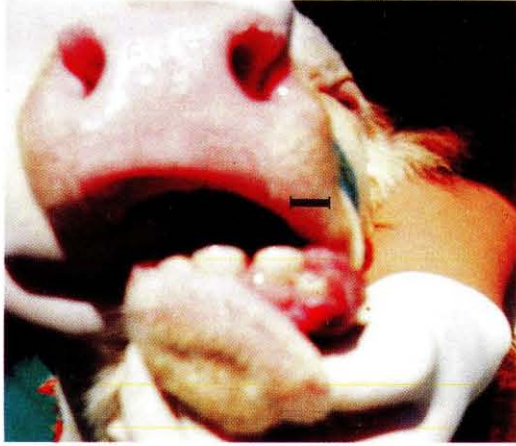
Figure 1. The pink-red cauliflower-like mass in incisor region of the mandibular gingiva of calf. Note the dislocation of incisor tooth embedded into tumoral mass. Bar: 1 cm.