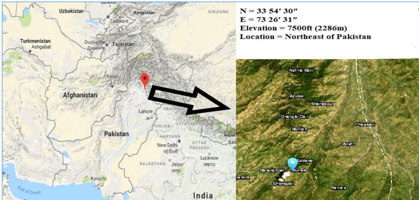
Figure 1. Study area and sampled sites in Murree, Pakistan.

wallichiana (pure), Pinus roxburghii (pure), Pinus wallichiana-Quercus baloot , Pinus wallichiana-Cedrus deodara , Pinus wallichiana-Abies pindrow , Pinus wallichiana-Quercus dilatata , Quercus dilatata-Cedrus deodara , Pinus roxburghii-Pinus wallichiana , Pinus roxburghii-Cedrus deodara , Pinus roxburghii-Quercus dilatata .