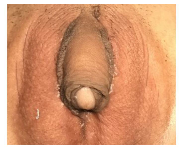
Fig. 1. Clitoromegaly (this picture does not represent the real patient).

At the age of 3 years, the child underwent clitoral reduction and vaginoplasty with the finding of clitoromegaly of 3.5 cm. After inserting a Foley catheter in both, the vagina and the urethra, a flap was created below the vaginal orifice followed by a vertical mid-