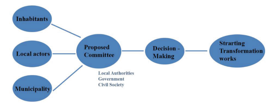
Figure 3. Proposed committee

As a result of the discussion about adaptive re-use approach applied in Medina of Fes it can be stated that adaptive re-use as a more recent and trend strategy which has brought the attention of the owners and has created a reason to go back to the Medina of Fes. Particular interest is given to the tourism potential which includes positive and negative effects. Therefore, the urgency and priority to its consequences are pointed out in this study.