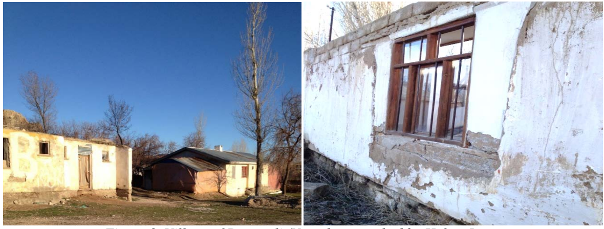
Figure 9. Village of Bayramli /Van photographed by Hakan Irven Figure 10. Village of Bayramli /Van / Briquettes of the external wall photographed by Hakan Irven