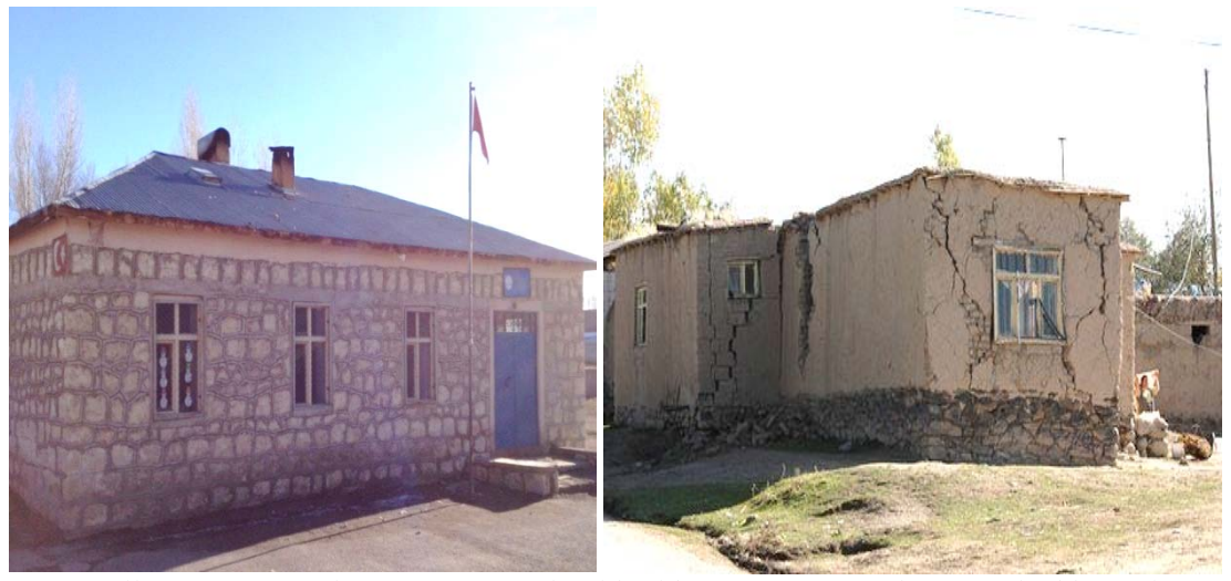
Figure 1. Village of Bayramli / Van/ stone school building [Irven, H.] photographed by Hakan Irven Figure 2. Village of Hamurkesen/ Van / Adobe building