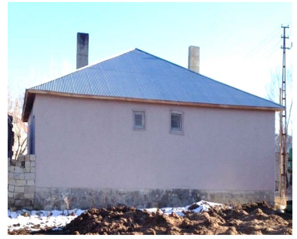
Figure 13. Village of Bayramli / Van/ building in the last period

The activities of change-transformation occurred in the village houses after the 1990s have gained speed. In the following years, the heat isolation and planning principles in the buildings have been adopted by the individuals. In this context, change and transformation can be observed within the framework of the emerging opportunities during this course of time in the rural area of the city of Van. This transformation in the countryside was not made by a plan and program; this should be done completely according to the basis of the individuals' own formats and planning (Figure 13).