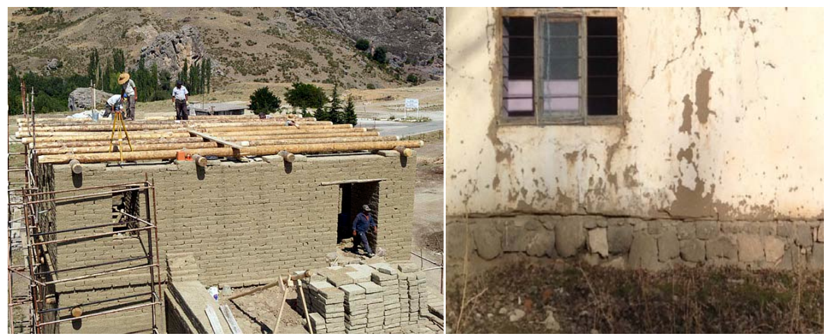
Figure 3. Village of Karahan / Van / Application of wooden roof [4] Figure 4. Village of Bayramli /Van / stone foundation photographed by Hakan Irven

Wood used often as a material in every period, continues today to be a material by increasing its importance. In the past, in the structure of the village houses wooden beams were preferred due to passing the opening in the upper floor, making light roof (Figure 3) and easy manufacturing. Today, wood is used generally for decorative purposes.