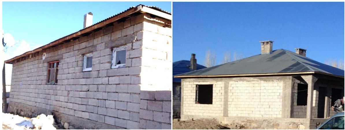
Figure 11. Village of Bayramli / Van/ Application of briquette structure photographed by Hakan Irven Figure 12. Village of Bayramli / Van / Application of masonry structure photographed by Hakan Irven