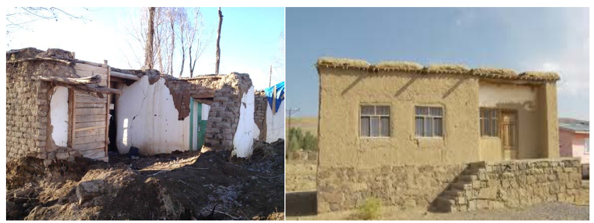
Figure 7. Village of Bayramli / Van/ structure from before 1990 photographed by Hakan Irven Figure 8. Village of Ocakli / Van / structure from before 1990