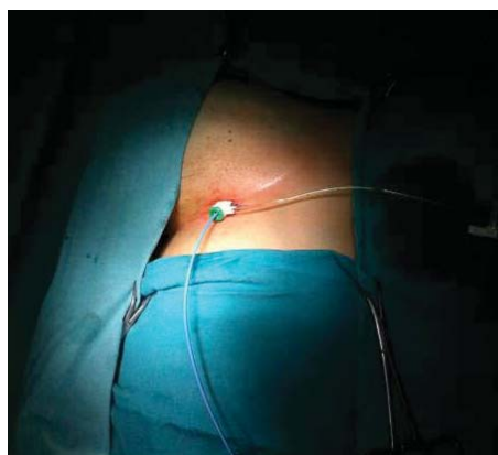
Figure 2. Pericardiocentesis via the right parasternal approach.

approach was chosen. Echocardiography-guided pericardiocentesis was performed under local anesthesia in the operating room owing to the increased risk for pneumothorax. A puncture needle was advanced through the sixth intercostal space at the right parasternal border, and nearly 600 mL of hemorrhagic fluid was aspirated (Figure 2). After pericardiocentesis, the patient's vital signs were as follows: pulse rate 85 beats/min, respiration rate 19 breaths/min, body temperature 37.5°C, and blood pressure 115/75 mm Hg. A very small amount of pericardial effusion was seen during TTE. The fluid cytology was compatible with metastatic disease. She died from respiratory failure three months after the procedure. Pericardiocentesis via the right parasternal approach can be used in a patient with severe comorbidity.