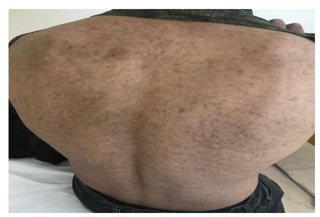
Fig. 2. Diffuse pigmented macules and patches on the back