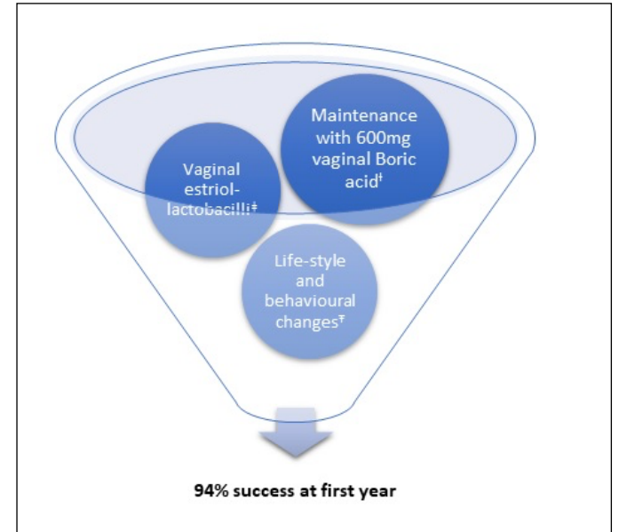
Fig. 1. Boric acid-based combination therapy for RCCV

(3) Several rigorous lifestyle and behavioral changes are seen. Couple was recommended to wash their external genitalia with warm water and mild or unscented soap prior to coitus. Patients was strained from vaginal washes, wipes, and douche with water and/ or soap, local irritants, oral sex and use of vaginal objects including tampon or vibrators. Patients was recommended to wear baggily and cotton clothes, to consume more yoghurt and kefir, reduce or quit smoking. Patients was suggested to avoid vaginal sex until their symptoms improved.