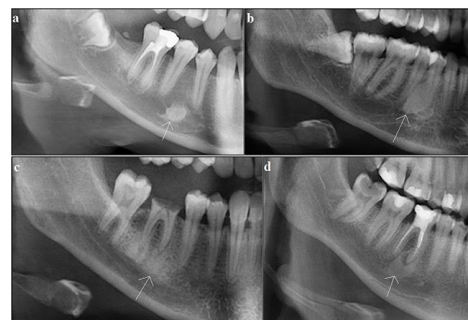
Figure 1. Idiopathic osteosclerosis (a,b) and condensing osteitis (c,d) with arrow.