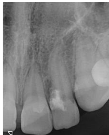
Figure 6. The 2-year follow-up periapical radiograph of maxillary left lateral incisor.