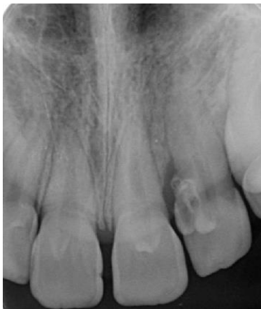
Figure 2. Periapical radiograph of maxillary lateral incisor demonstrating dens invaginatus with periradicular radiolucency.