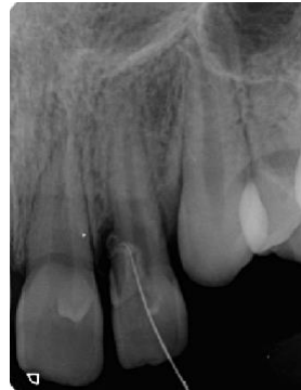
Figure 4. The length determination radiography of invaginated root canal.