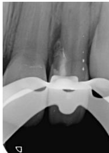
Figure 5. Periapical radiograph of maxillary left lateral incisor demonstrating MTA root canal filling of invaginated canal.