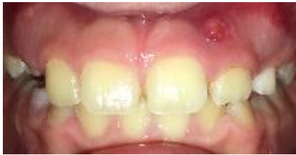
Figure 1. Labial view of the maxillary left lateral incisor.

After 2 years, follow-up radiograph revealed the absence of radiolucency, the patient was remained asymptomatic and pulp vitality was continued (Figure 6).