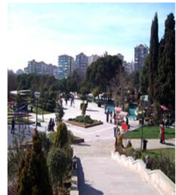
Özgürlük Earthquake Park