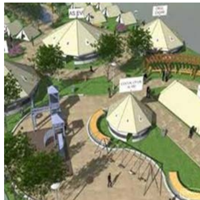
Esenler Earthquake Park