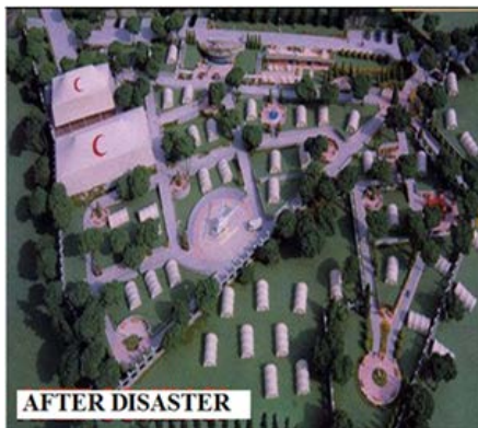
Aykut Barka Earthquake Park

Freedom Park is planned to meet a short time after the disaster in public care to be converted into housing. Planned use of existing as well as new areas of parks in the area after the disaster to ensure the health and quality of life standards are integrated into the project