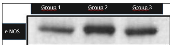
Figure 2: The picture shows a representative Western blots investigating endothelial nitric oxide synthase levels (eNOS) in brain tissue.

For this reason, it was thought that PcTx1 venom may be effective in vasospasm through direct inhibition of ASIC1a. Severe oxygen depletion that occurs during ischemic stroke causes acidosis through increased lactate levels in order. Anaerobic glycolysis oxidative phosphorylation causes brain damage. pH drops and this severe ischemia occurs. 13-15 In vivo studies show that acidosis increases ischemic brain injury and has been shown to have a direct correlation between brain acidosis and infarct size. Acidosis caused by decrease in cerebral pH can be activated by acid-sensing ion channels (ASIC) and this activation has been suggested to play a critical role in stroke caused by neuronal damage. 24 (Figure 2).