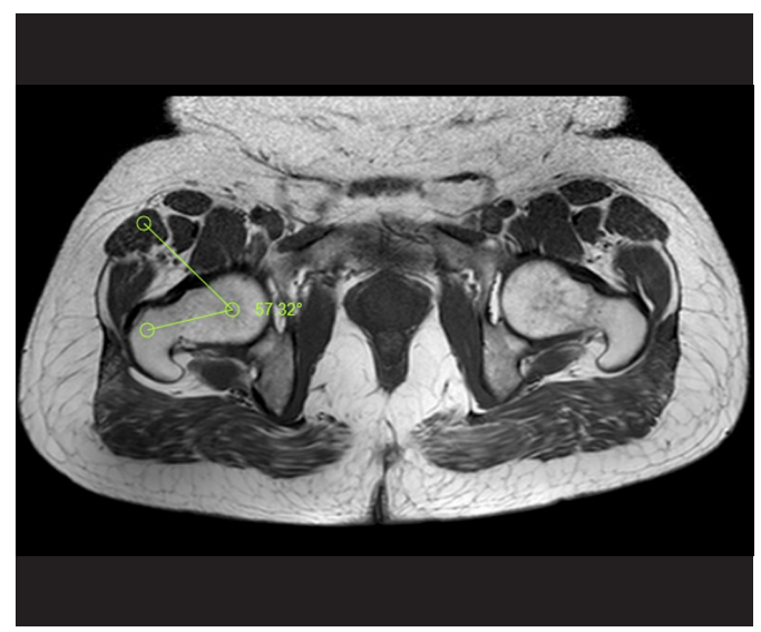
Figure 1. 43-year-old male, alpha angle measurement.

the angle between the perpendicular line drawn from the center of the femoral head to the acetabulum and the line connecting the outermost point of the acetabulum ( Figure 2 ). Measurements were compared statistically between the groups. A value of p<0.05 was considered statistically significant.