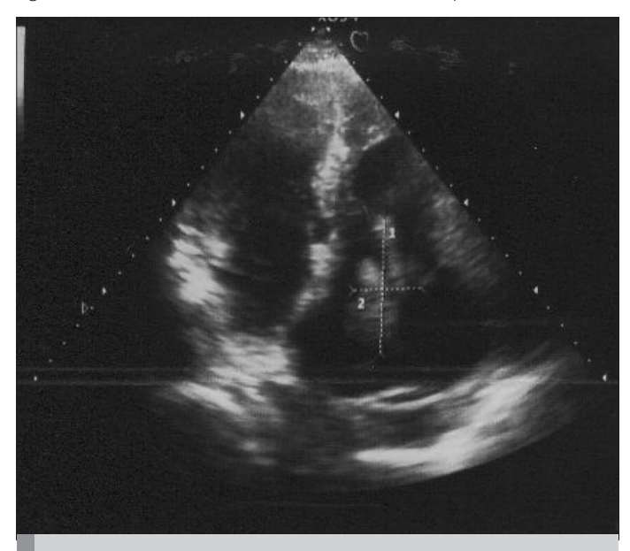
Figure 1. A right atrial thrombus extending to the ventricle in apical four chamber imaging

tion one month ago (Figure 1). Computed tomographic pulmonary angiography (CTPA) was planned; a filling defect associated with the right atrium thrombus, a right pleural effusion and a mosaic pattern in lung parenchyma was detected. The patient, who had no sign of pulmonary embolism, was hospitalised for advanced assessment and therapy.