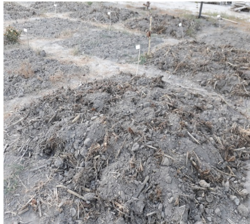
Photograph 1: Images of June, July, August, October respectively

Because tractors cannot be entered into the land, the mixture of the sludge-cornstalks-soil was ventilated by hand. The results and methods of analysis are given below.