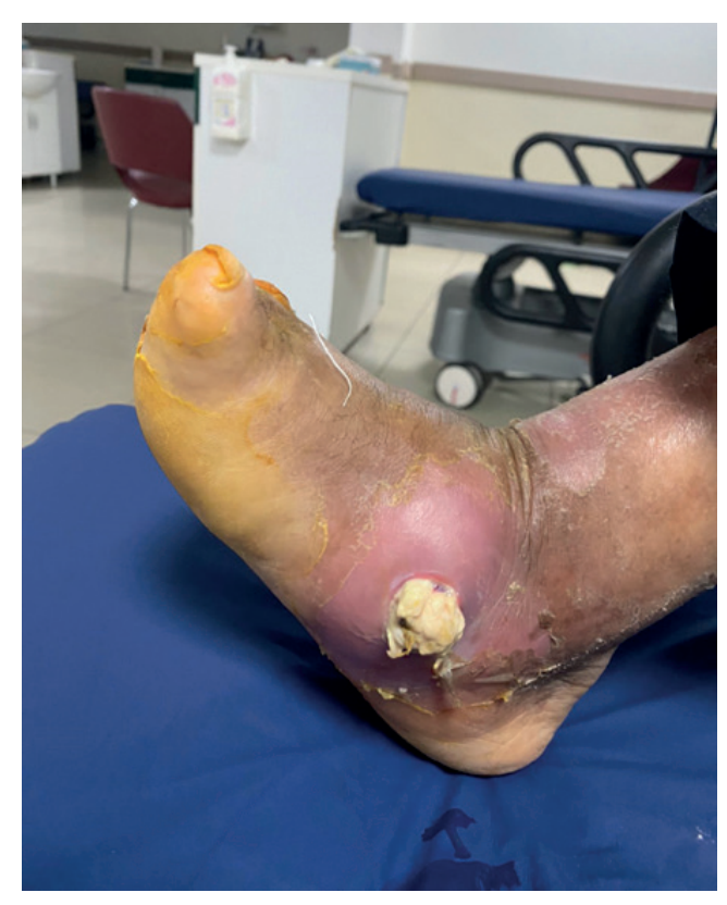
Figure 3: Bone protruding beyond the skin on the medial side of the right foot.

the exacerbation of diabetic foot ulcer wounds and infection. The common causes of DKA are missed doses of insulin, illness or infection, and undiagnosed or untreated diabetes. We believe that our patient's DKA attack may have been triggered by the recent infection.