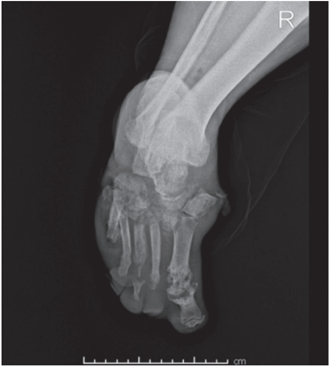
Figure 1: Anteroposterior radiograph demonstrates diffuse degenerative changes and subluxation were observed in all metatarsal bones. Distal metatarsals were not observed in the 2nd 4th and 5th fingers. Destructed appearance secondary to widespread degeneration in the distal metatarsal of the third finger. A subluxation to the dorsum of the foot in the medial cuneiform near the first toe and a fistulous appearance to the skin were observed at this level.