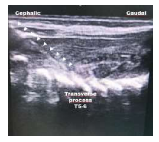
Figure 2. Ultrasound image of paravertebral block showing the needle (arrow head) on top of the transverse process of T5-6.