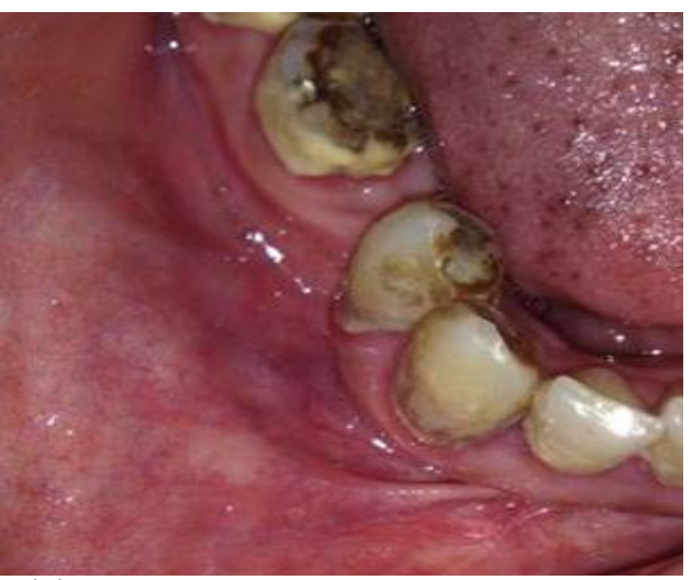
Figure 4. Post-operative intra oral picture.