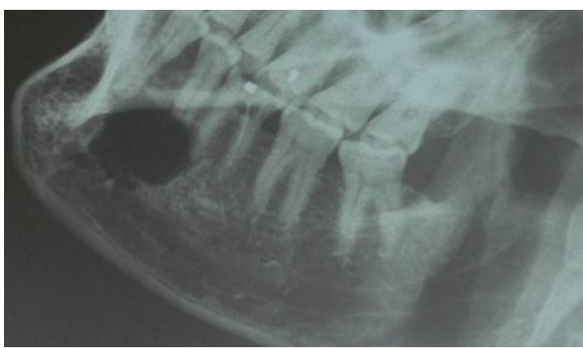
Figure 2. Lateral oblique body of the right mandible showing well defined oval shaped radiolucency extending from root of mandibular right canine to the mesial root of mandibular right first molar.