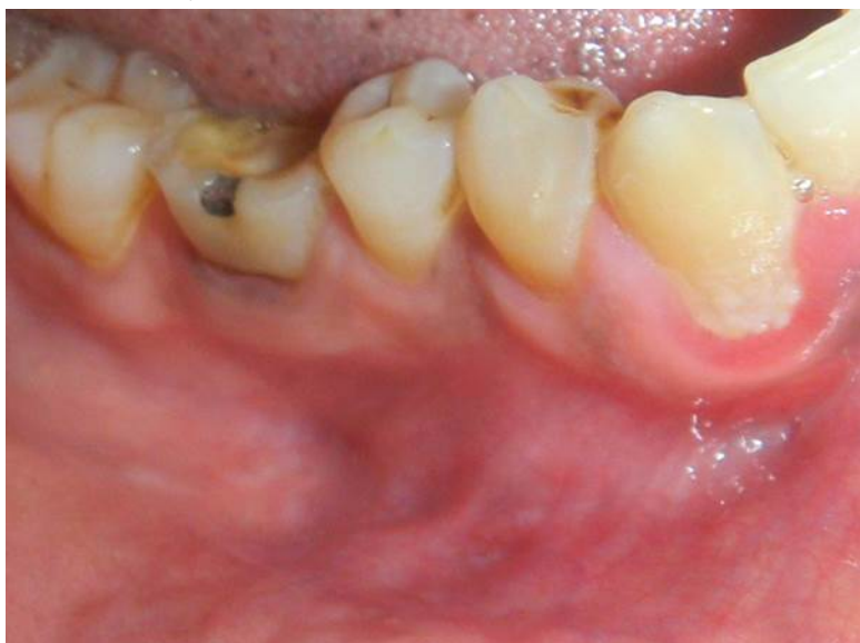
Figure 1. Intraoral pre op picture showing obliteration of the buccal vestibule extending from mandibular right canine to mandibular right first molar.

The histology of the enucleated cyst showed cystic cavity lined by disrupted odontogenic epithelium with connective tissue capsule. Thick band of dentinoid formation was evident at epithelium connective interface. tissue Odontogenic epithelial islands and proliferating ameloblastomatous follicles in the deeper part of connective tissue capsule. Moderately dense collagen bundles with foci of chronic inflammatory infiltrate. Hence the final diagnosis given was transmural variant of unicystic ameloblastoma. The patient has been under follow up for one year with no functional or aesthetic complaints (Figure 4).