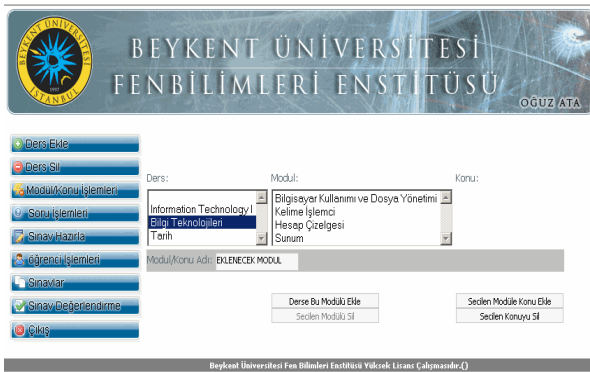
Figure 6. Addition of module or subject to selected course

To add or delete a module/subject to selected course, “Modül/Konu İşlemleri” bottom must be pressed. To add/delete a subject can be done as shown in Figure 6 .