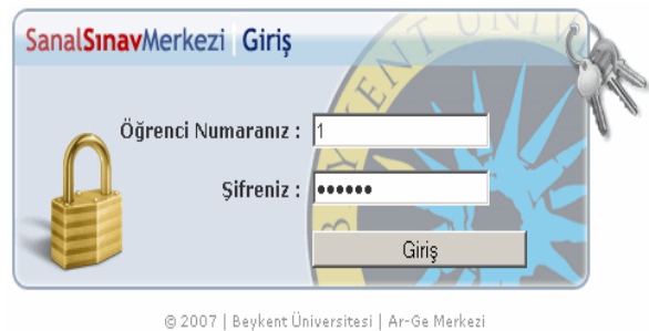
Figure 2. Login Screen

To enter the system, login name which is student name and password is requires as shown in Figure 2.