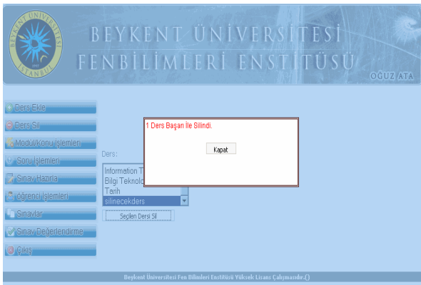
Figure 5. Course deletion screen

To delete a course “Ders Sil” button is pressed than Figure 5 is shown by the developed program.