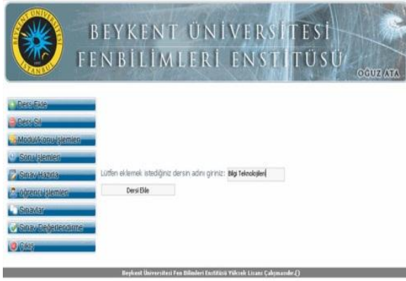
Figure 4. Course addition screen

To delete a course “Ders Sil” button is pressed than Figure 5 is shown by the developed program.