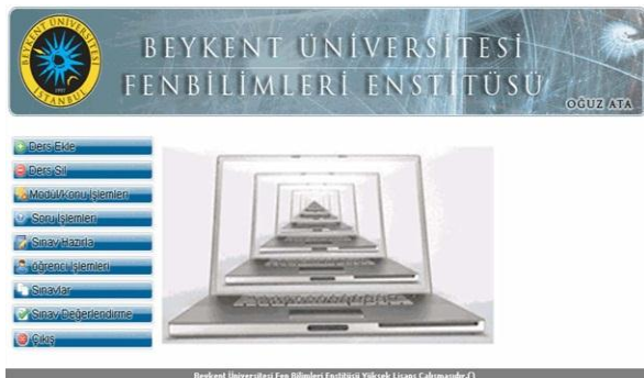
Figure 3. Administrator Screen

If your account has administrator privilege than Figure 3 is appear.