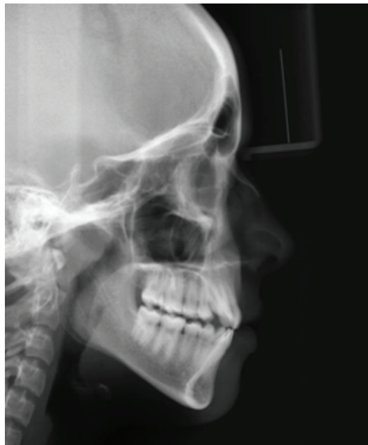
Figure 2. (A) Pre-treatment lateral cephalometric, (B) Post-treatment lateral cephalometric