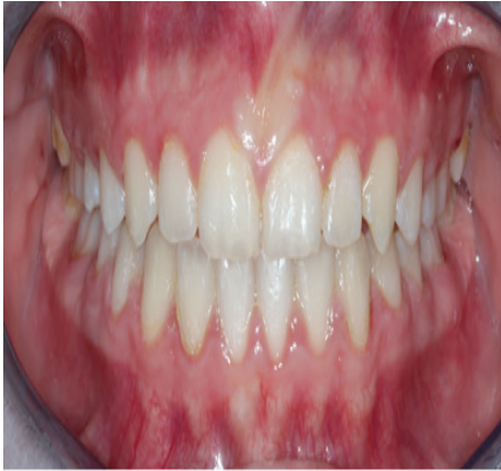
Figure 6. Intra oral photographs (A) Pre-treatment, (B) Post-phase I treatment, (C) Post-phase II treatment