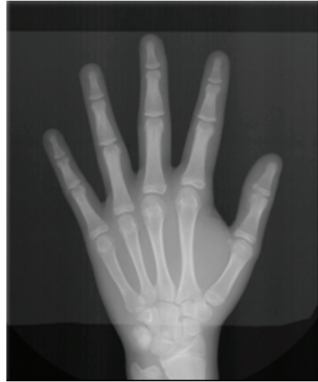
Figure 1. MP3cap stage.

and wrist revealed the optimal age to begin Phase I treatment. In the MP3cap stage, the patient's skeletal age was 13 years (Figure 1). According to the cephalometric measures (Table 1) and the genetic feature, the patient and parents were informed that an undesired development pattern could emerge (Figure 2).