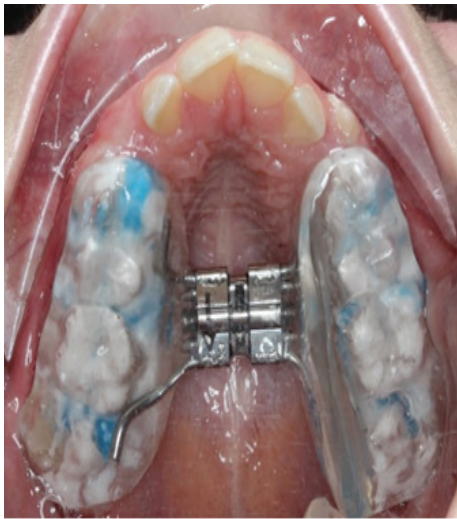
Figure 3. Cementing with glass ionomer cement.

Because the patient committed to using the expanders and, most significantly, dental hygiene, the patient was instructed to correct complete crossbite as soon as possible in Phase I. The patient and her family were instructed about the Haas, HYRAX, and quad-helix expander designs. Due to an absent crossbite on the left side, the Single Lingual Sheath Hyrax Screw Bonded Expansion was selected. The permanent molars and premolars on both sides of the maxilla had been bonded. The expansion device could then be cemented with glass ionomer cement (Figure 3).