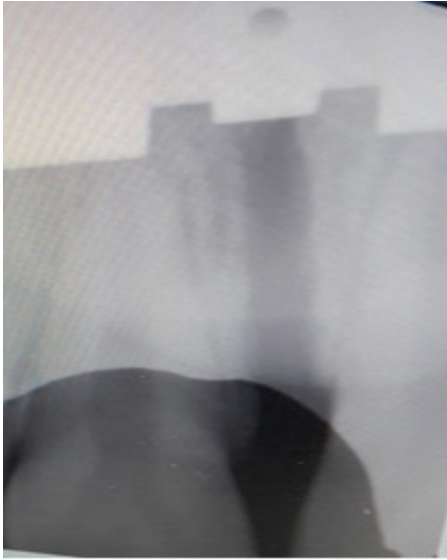
Figure 4. Periapical x-ray between teeth no 21 and no 11 shows the mid-palatal suture opening after 33 screw activations

In Phase I, the RME corrected the crossbite through the posterior maxillary teeth tipping. Furthermore, a clinically significant increase in the volume of the maxillary arch allowed the incisors to align with the occlusal line (Figure 5).