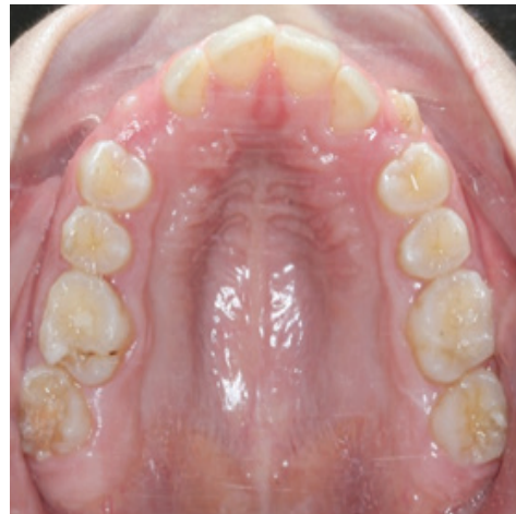
Figure 5. (A) Pre-treatment intra oral photograph, (B) Post-phase I treatment.