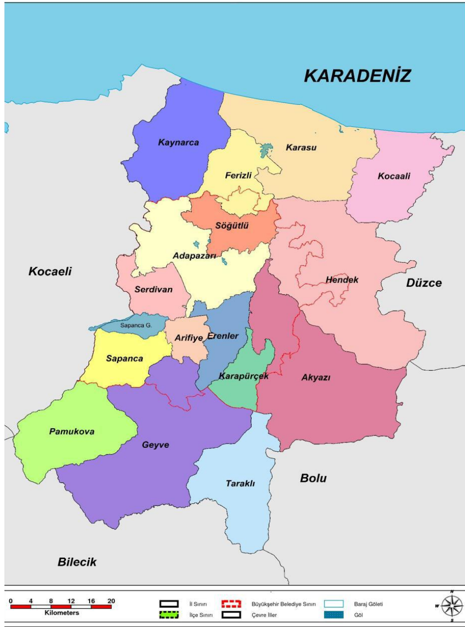
Figure 1. The Location of City of Sakarya

According to the data available for the year 2011, the total population in the city is 888,556. 75 per cent of this population lives in the city and district centres. The number of inhabitants per square kilometre is given as 184 people by the same data.